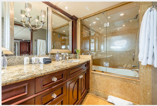
Guest Bath - Stbdside Aft