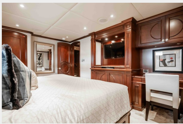
Guest Stateroom - Portside Aft