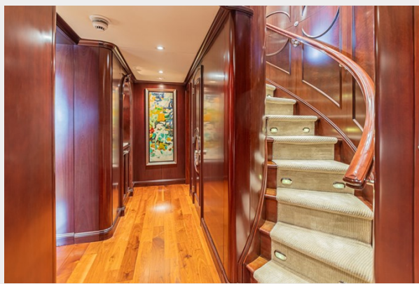
Lower Deck - Foyer