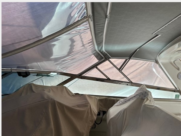
Covered helm and cockpit interior