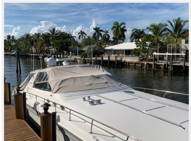
Forward Deck Area