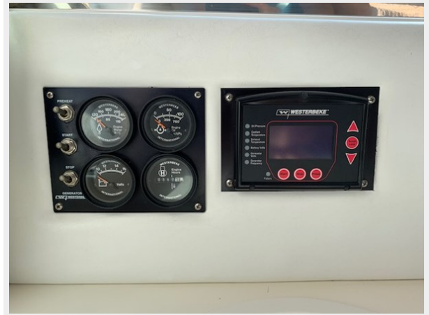
2nd Gen Control Panel