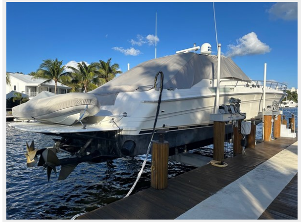
Stbd side on lift