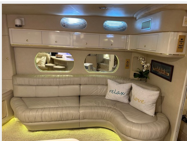
Salon Couch to Starboard