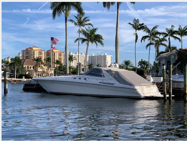
Port Side At Dock