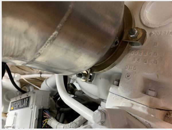
Engine Room Exhaust