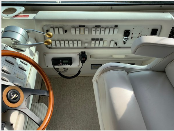
Control Panel Stbd of Helm