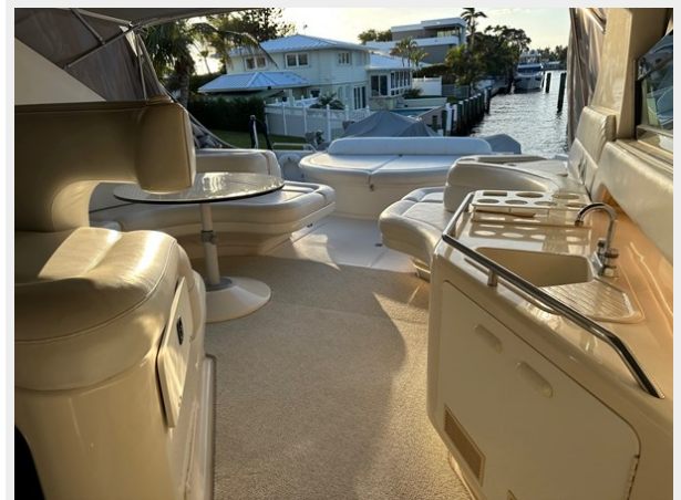
Looking Aft to Cockpit Deck