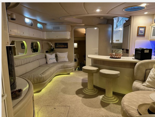
Salon looking aft to guest SR and stairs up to helm deck