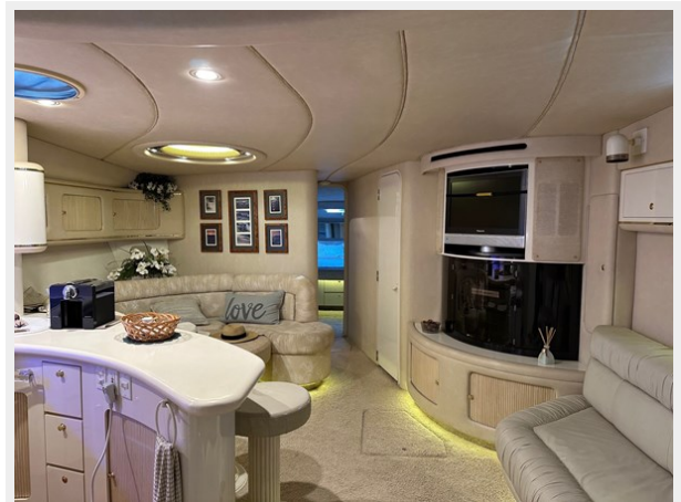
Salon Looking Fwd