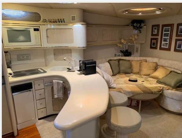
Galley and Port Side Salon