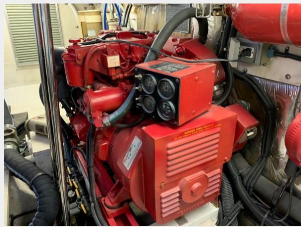
Main Gen Set Engine Room