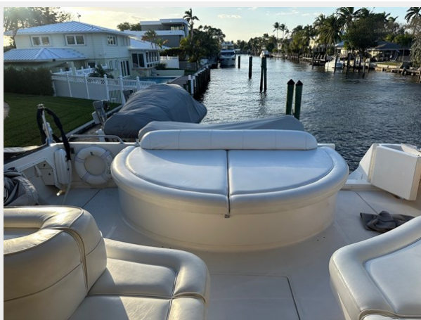
Cockpit area sunpad and transom door to swim platform