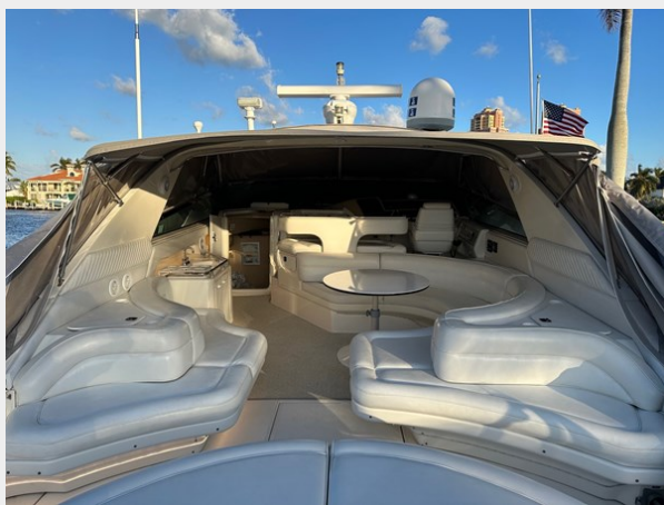
Cockpit deck looking fwd to helm area