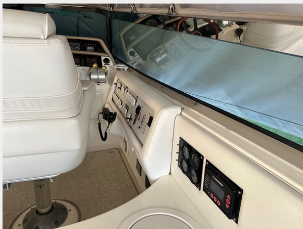
Helm Area Control Panel to Stbd