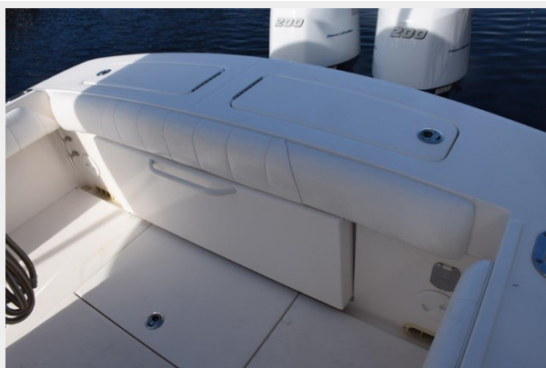
016 - Cockpit