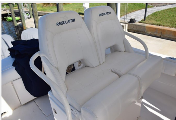
010 - Seats with bolsters down