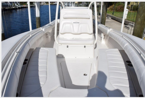
026 - Cushion for forward seating are indoor stored when not in use