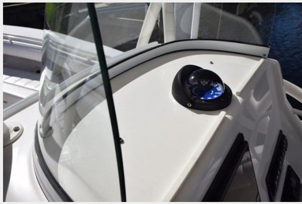
012 - Curved plex windshield and magnetic compass