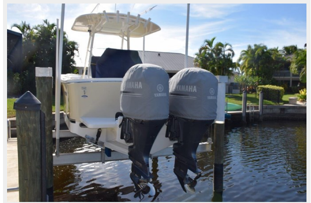
Yamaha engine covers