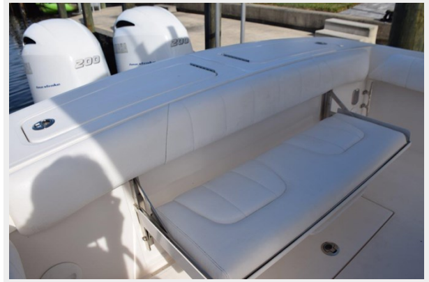
019 - Fold down rear bench seat (1)