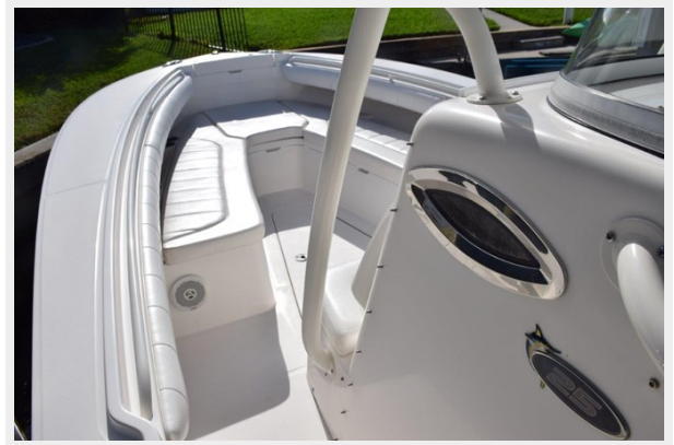
027 - Full coaming pads, opening portlight to beneath console