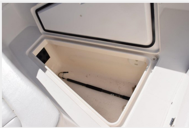
028 - Huge fishbox (or rod storage) beneath forward seating deck