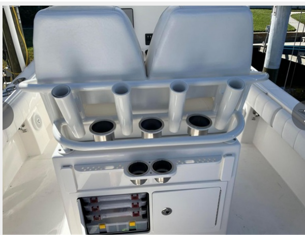
022 - Rocket launcher, tackle cabinet