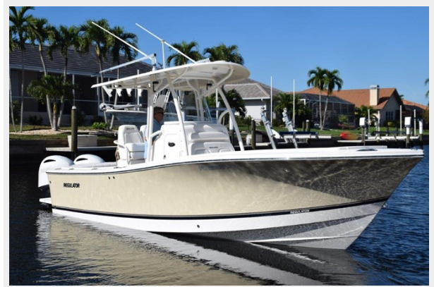
Attractive shear line