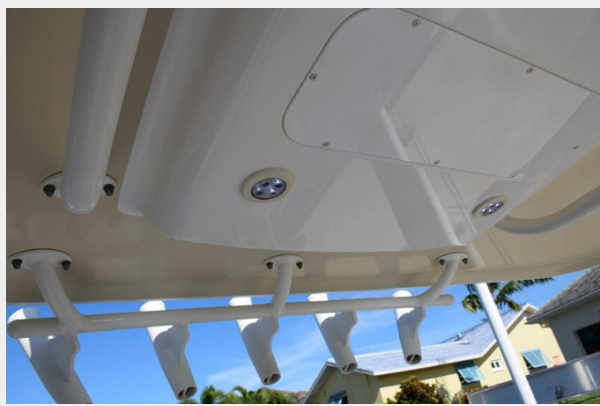
014 - White powder coating and LED hardtop lights