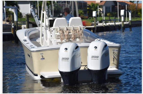
003 - White Yamaha cowling mounted on bracket