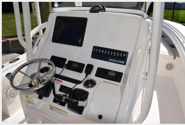
Helm has drink holders and glovebox