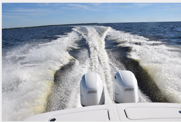
Easy cruise at 30+ knots