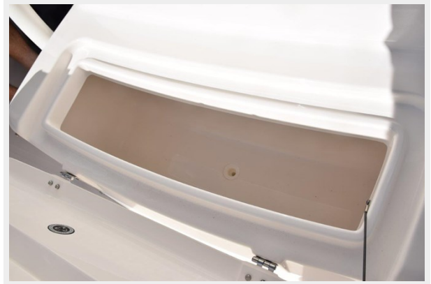
Cooler beneath forward console seat