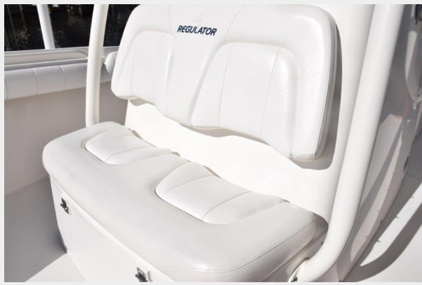
024 - Forward console seat