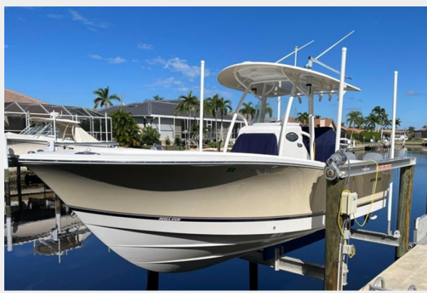
004 - Profile on boatlift