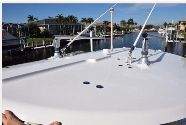
Factory hardtop with antenna and lights on pivot mounts