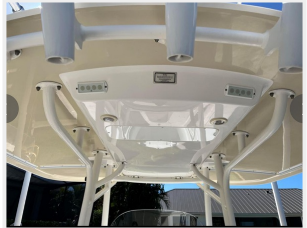
007 - Hardtop