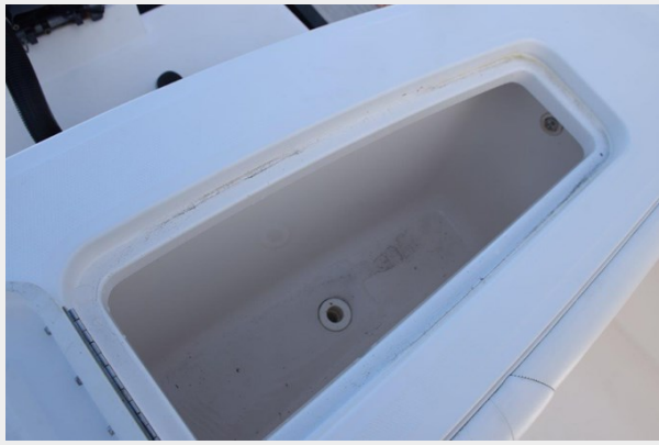
018 - Transom fishbox