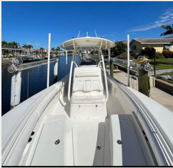
006 - Aft view from bow