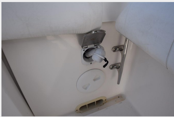
020 - Fresh water shower hose