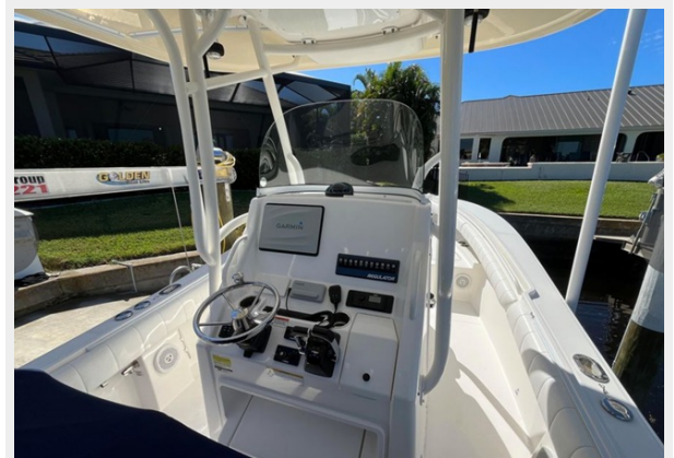
009 - Helm