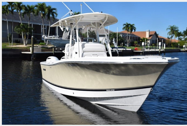
002 - Bow profile