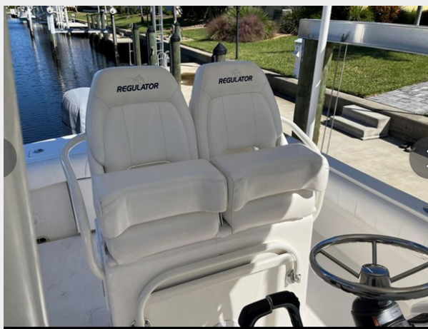
008 - Helm seats