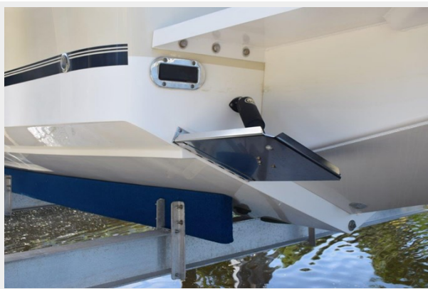
No bottom paint, always lift kept