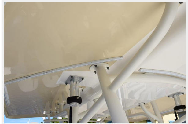
015 - Sidewinder outriggers and track for enclosure