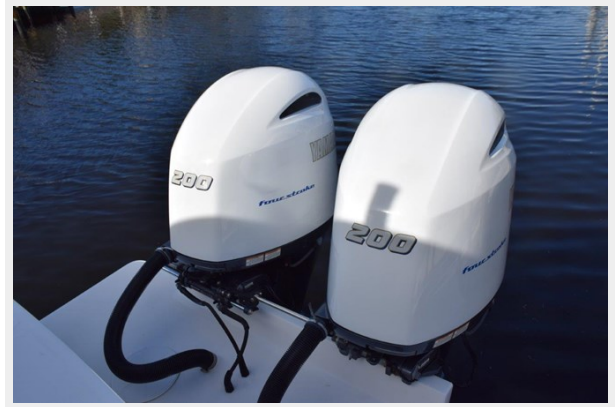
Yamaha with low hours and recent service