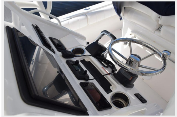
013 - Tiltable helm wheel with speed knob