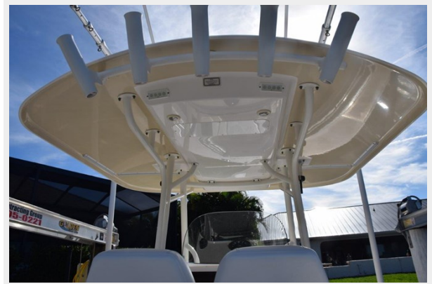
Underside hardtop color matched to hull sides