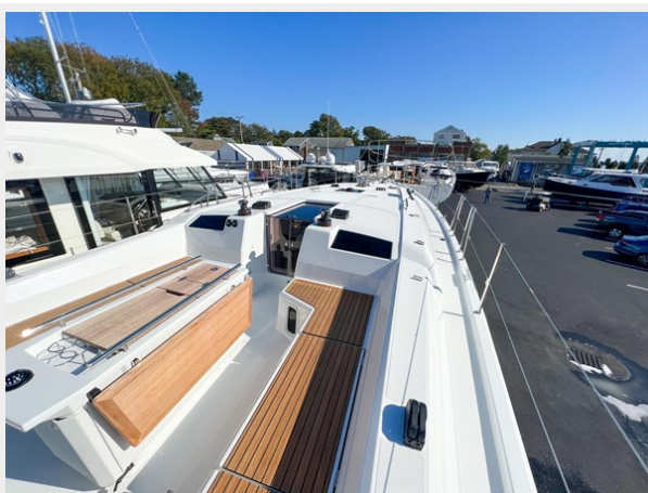
BENETEAU Oceanis 40.1