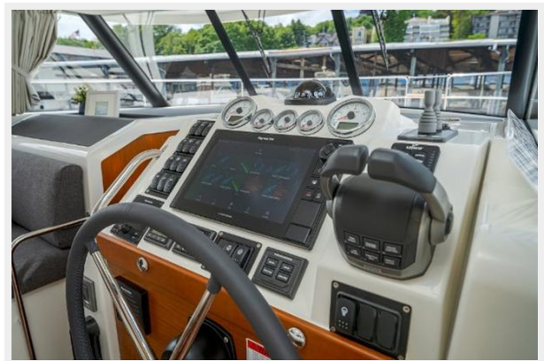
BENETEAU Swift Trawler 41 HELM