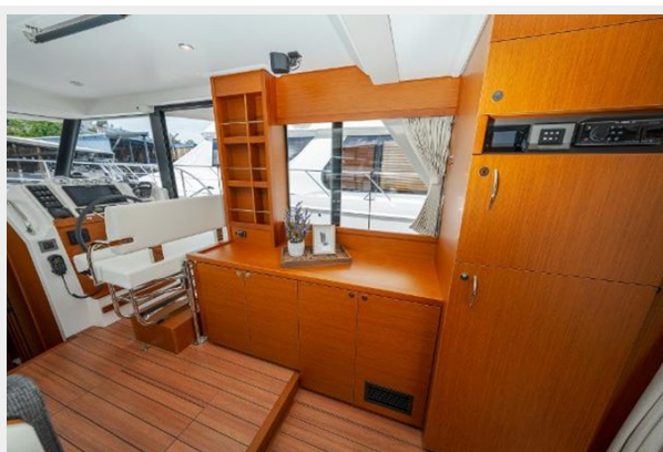
BENETEAU Swift Trawler 41