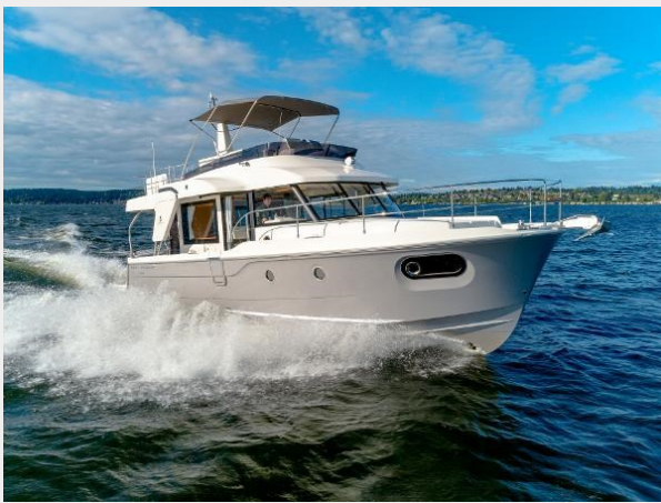
BENETEAU Swift Trawler 41 Fly Grey Hull