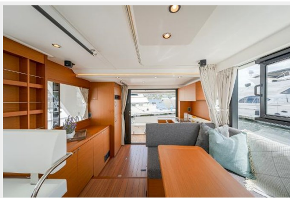
BENETEAU Swift Trawler 41 SALON