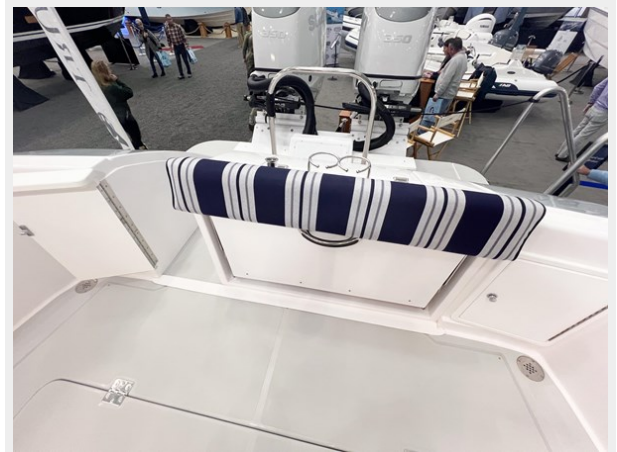
True North 34 Aft Seating Folded