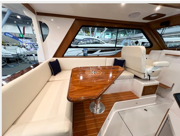
True North 34 Seating