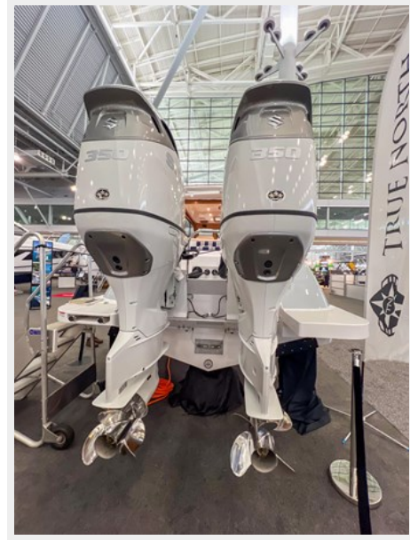
True North 34 Engines