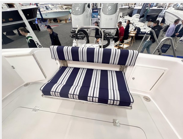
True North 34 Aft Seating