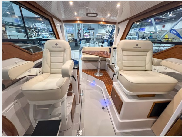
True North 34 Helm Seating