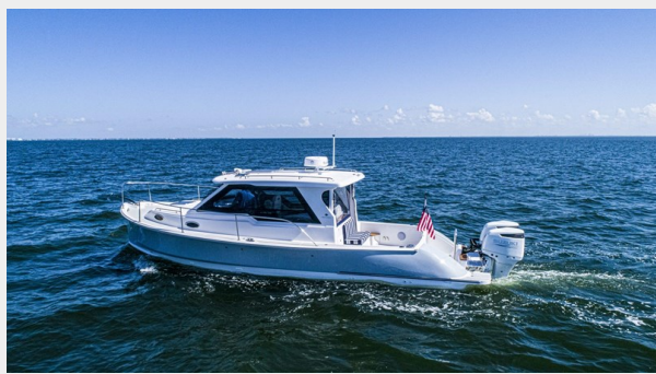
True North 34 Cockpit with aft seating