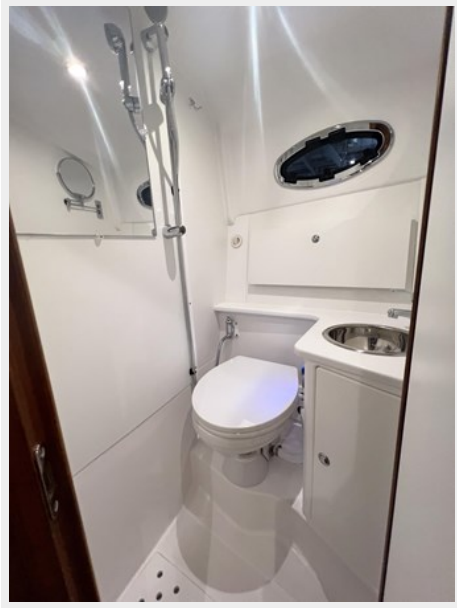
True North 34 Head