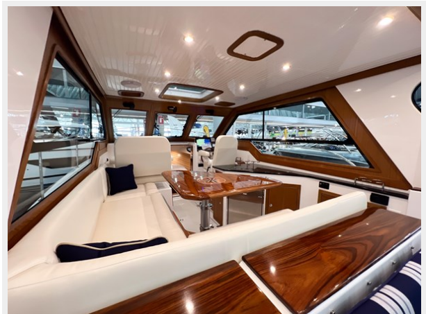
True North 34 Salon