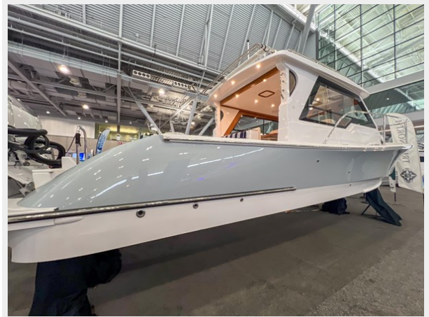
True North 34 Starboard Side