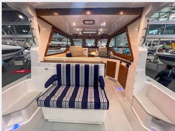
True North 34 Aft Seating