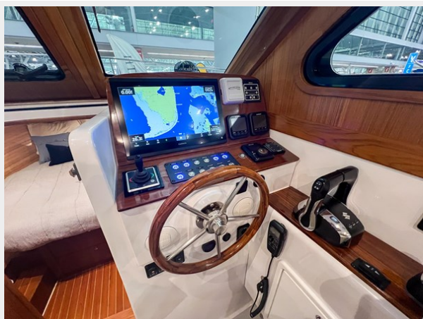
True North 34 Helm