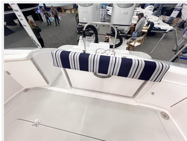
True North 34 Aft Seating Folded