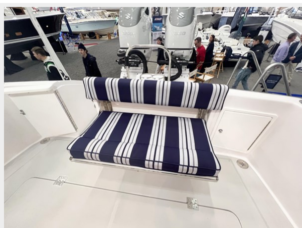
True North 34 Aft Seating