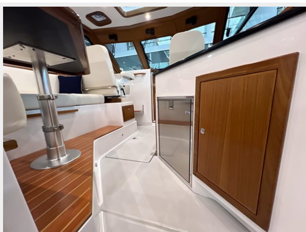
True North 34