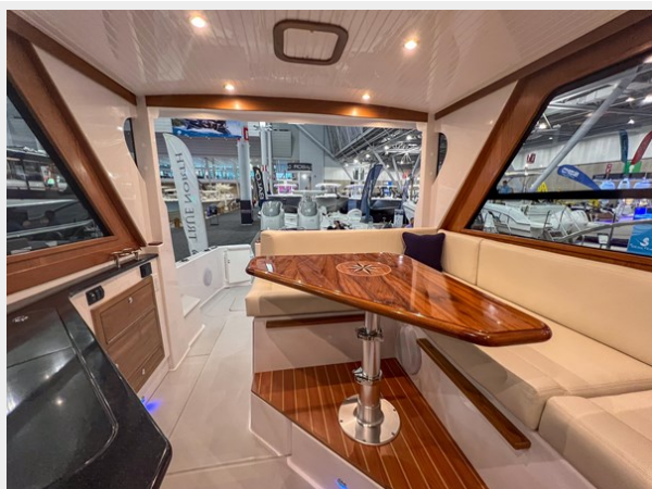
True North 34 Salon