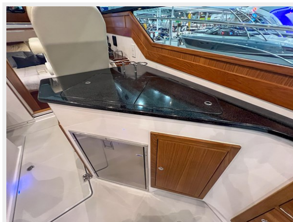
True North 34 Galley