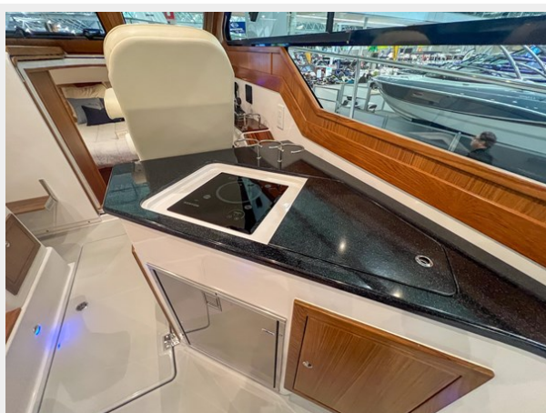
True North 34 Cooktop