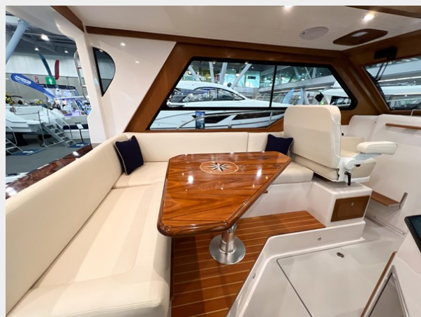
True North 34 Seating