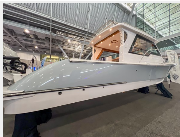
True North 34 Starboard Side