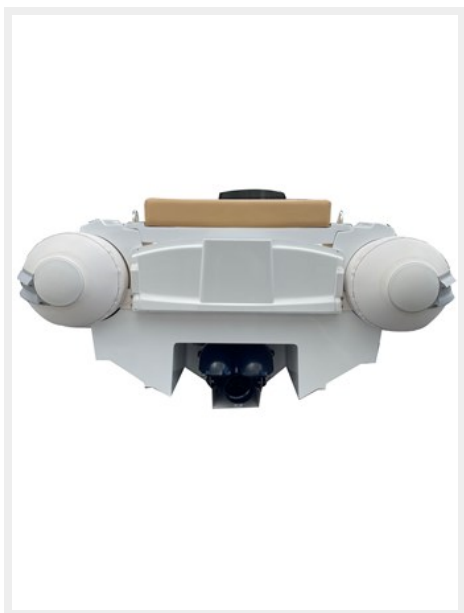
Diesel 15 transom