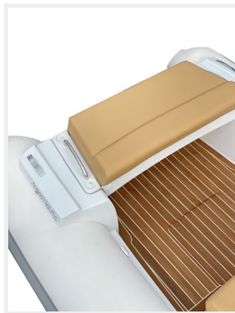
Diesel 15 removable bench