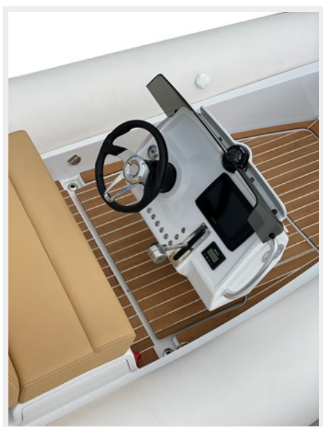
Diesel 15 white console