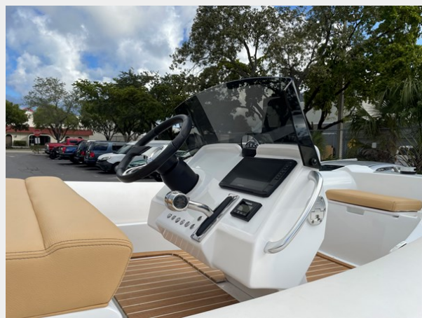
Diesel 15 Console view