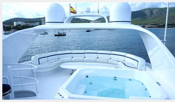
Moonraker Flybridge Jacuzzi