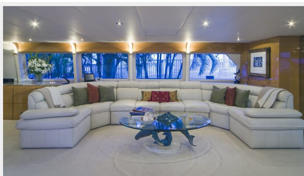
Moonraker Norship for sale salon