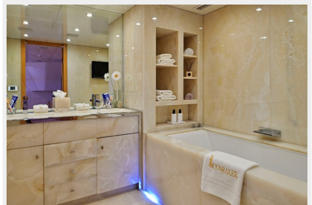
Moonraker 36m Norship Master Bath