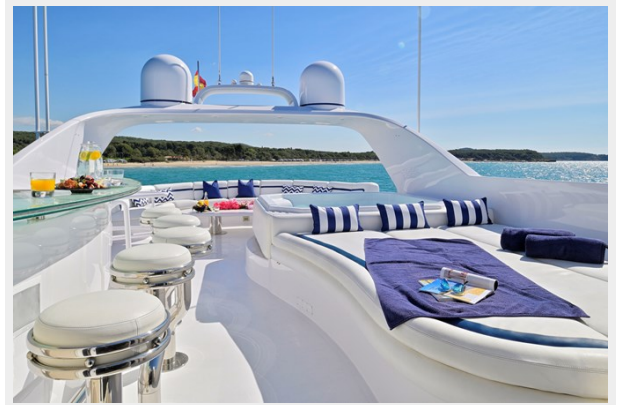
Moonraker Flybridge Aft Sunning