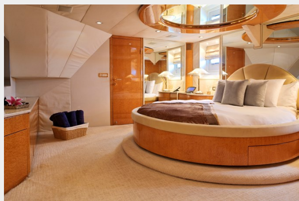
Moonraker Master Stateroom