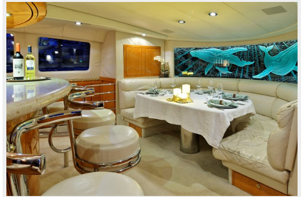
Moonraker 36 M Norship Galley