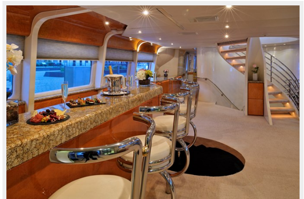
Moonraker Salon Bar