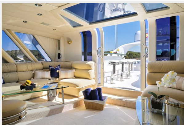
Moonraker Skylounge Aft