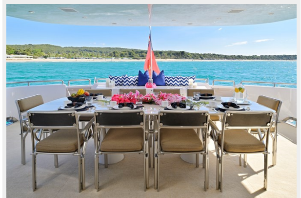
Moonraker 119' Norship Aft Deck