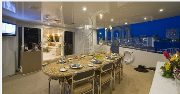
Moonraker Aft Deck Dining