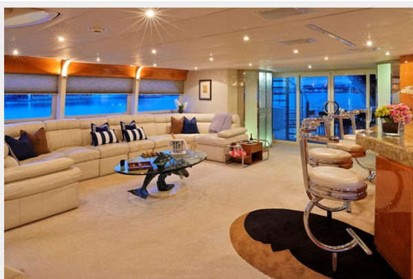
Moonraker Salon Aft View