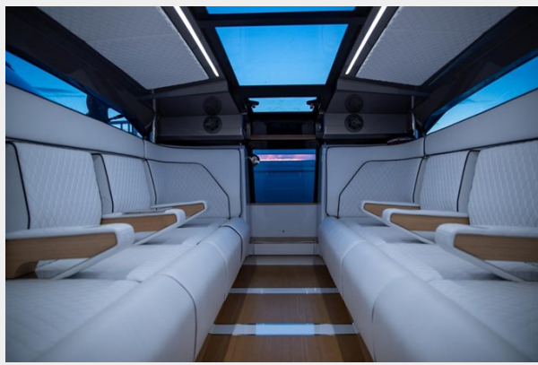
| INTERIOR (3)