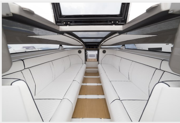
MAORI LIMO - 2024 MOTOR YACHT FOR SALE | INTERIOR (7)