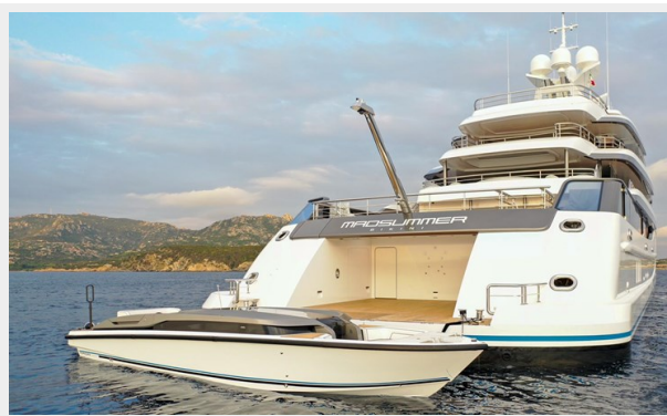
MAORI LIMO - 2024 MOTOR YACHT FOR SALE | EXTERIOR (3)