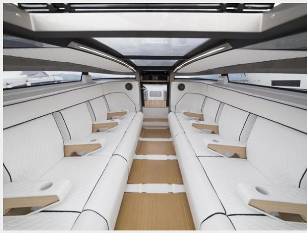
| INTERIOR (5)