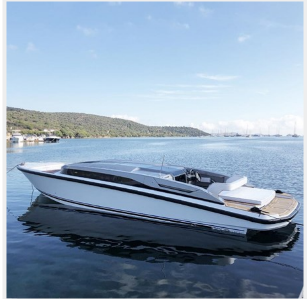
MAORI LIMO - 2024 MOTOR YACHT FOR SALE | EXTERIOR (2)