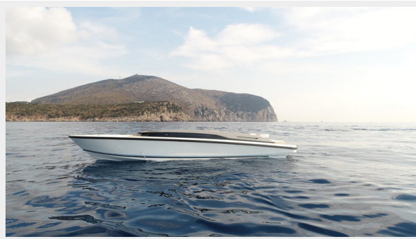
MAORI LIMO - 2024 MOTOR YACHT FOR SALE | EXTERIOR (1)