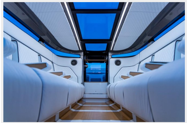
| INTERIOR (6)