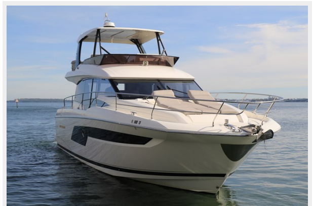
04 From Dock