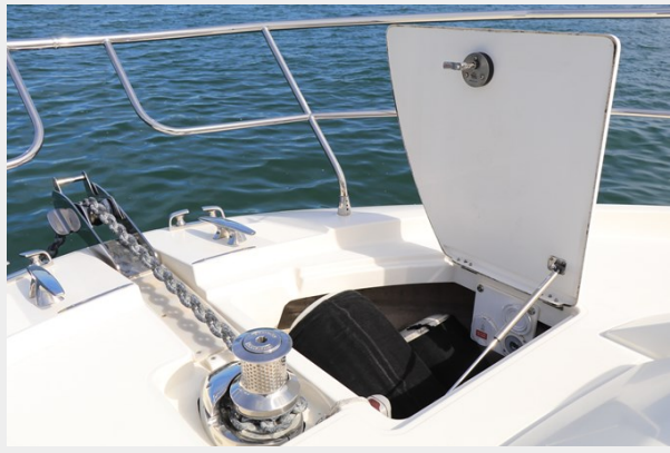
13 Anchor Locker