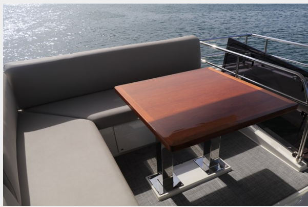
15 Bridge Table