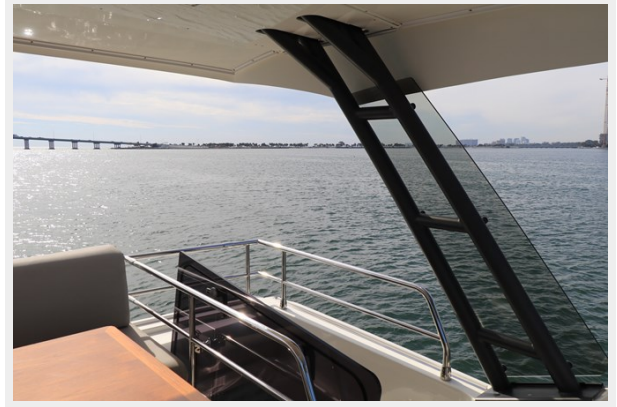
14 Aft Bridge