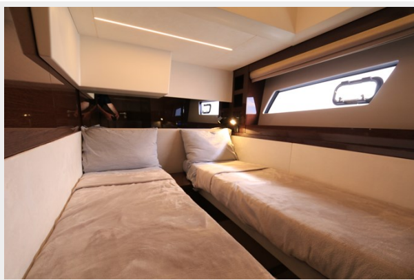
29 Mid State Room