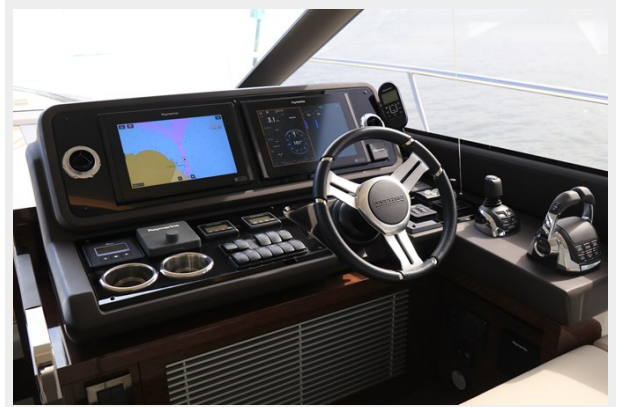
28 Lower Helm