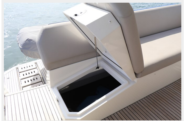
10 Lazarette Entrance Hatch