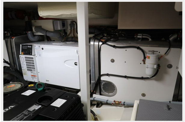
20 Engine Room Generator