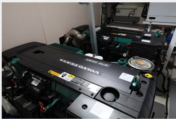
17 Engine Room