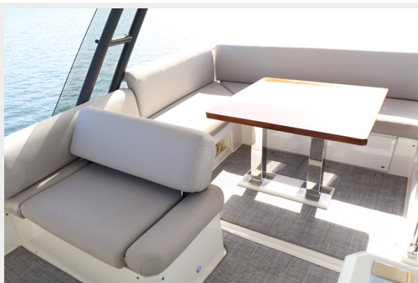
05 Fly Bridge Table