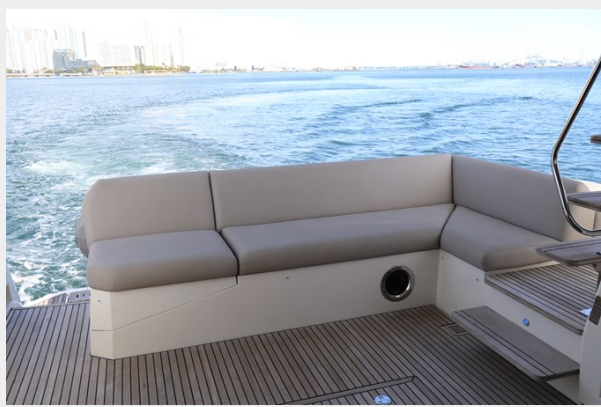
09 Aft Seat 2