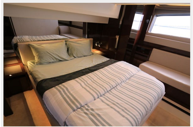
22 Master Stateroom