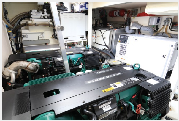
19 Engine Room 3