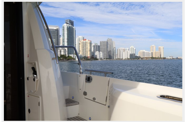
08 Aft Deck