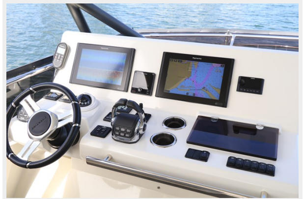
16 Bridge Electronics