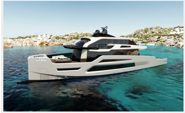
MAORI 125 YACHT FRO SALE - DELIVERY IN 2026 (2)