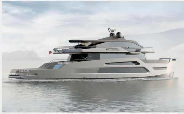
MAORI 125 YACHT FRO SALE - DELIVERY IN 2026 (1)