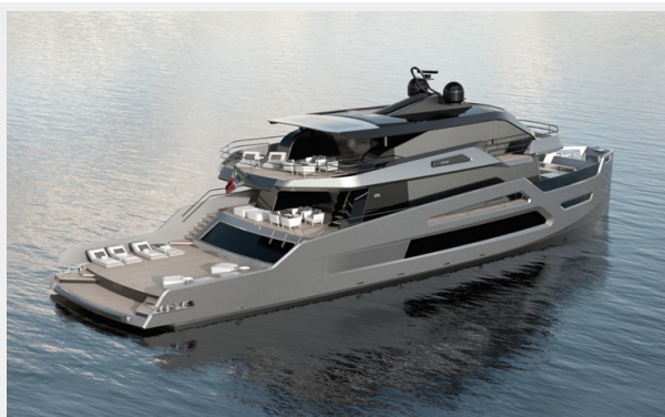
MAORI 125 YACHT FRO SALE - DELIVERY IN 2026 (3)