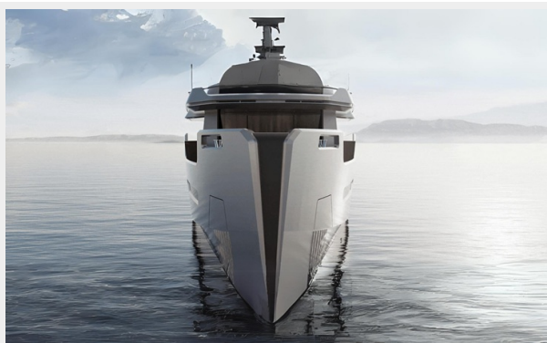
MAORI 125 YACHT FRO SALE - DELIVERY IN 2026 (5)