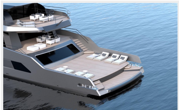
MAORI 125 YACHT FRO SALE - DELIVERY IN 2026 (4)