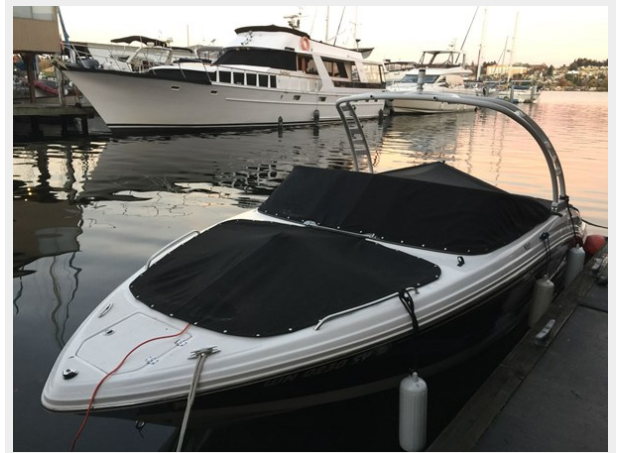
Chaparral 230 ssi - canvas covers