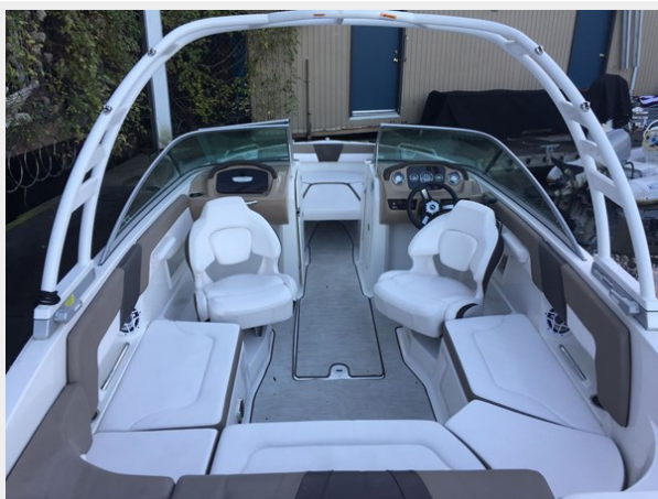
Chaparral 230 ssi - Cockpit Seating