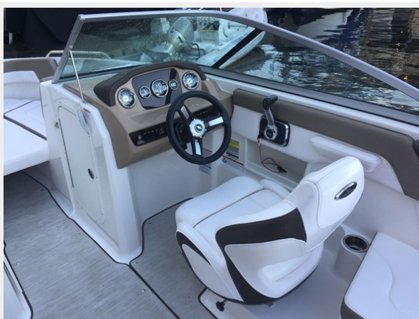
Chaparral 230 ssi - Helm