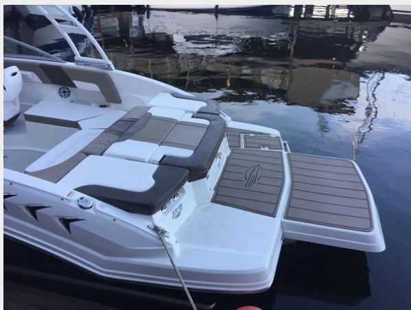
Chaparral 230 ssi - Swim Platform