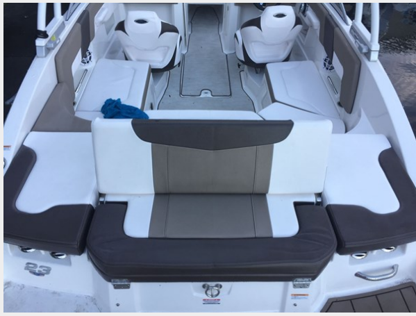
Chaparral 230 ssi - Looking Forward