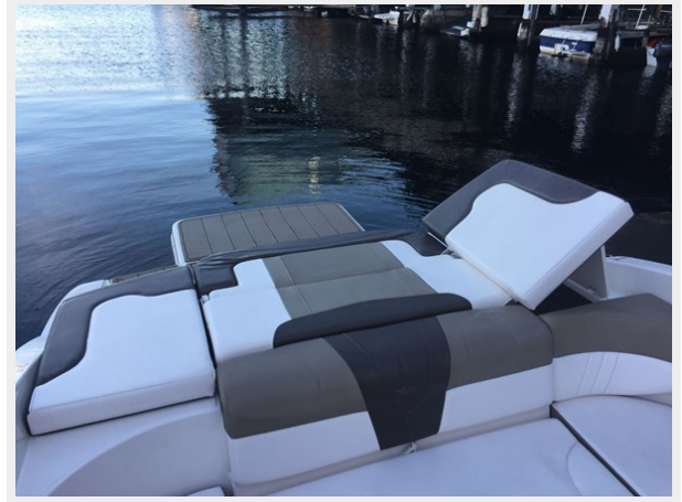
Chaparral 230 ssi - Stern