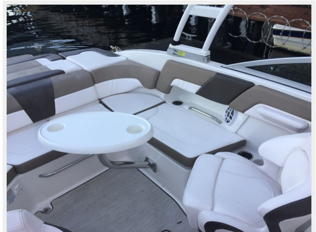
Chaparral 230 ssi - Cockpit Table