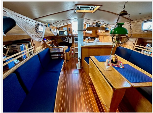
Freedom 33-MKII Cat Ketch - Looking Aft