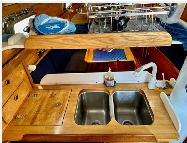
Freedom 33-MKII Cat Ketch - Galley