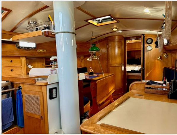
Freedom 33-MKII Cat Ketch - Looking forward