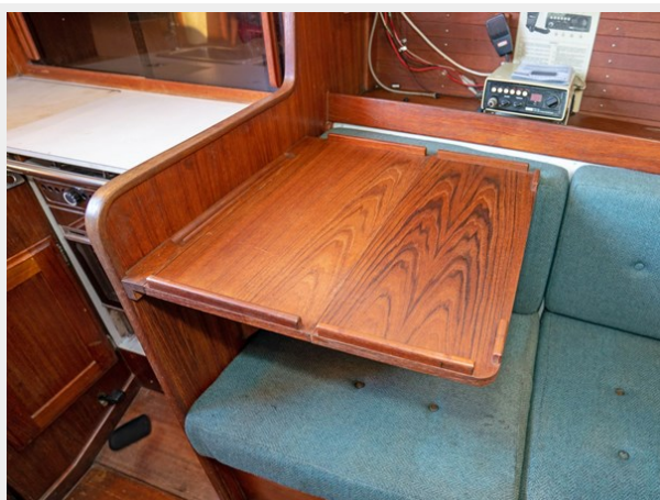
J Boats - Galley Extension