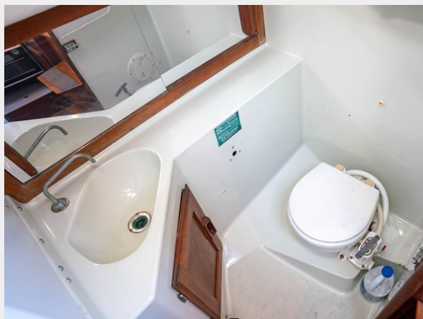
J Boats - Head