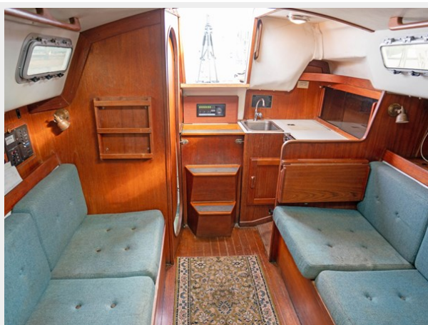
J Boats - Looking Aft