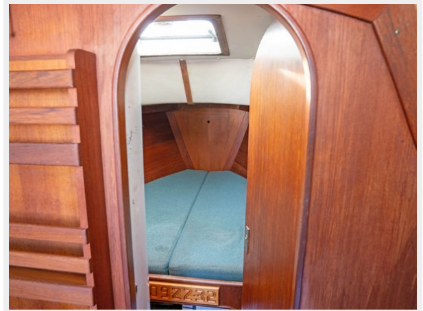
J Boats - Forward Cabin