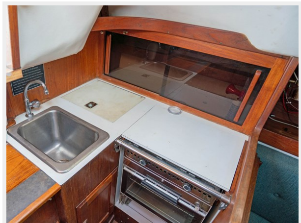
J Boats - Galley