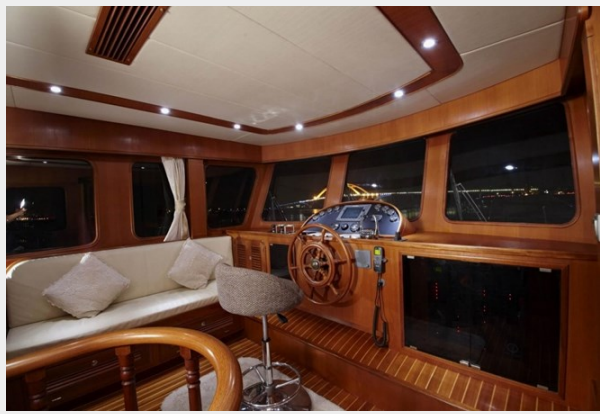
Lounge Helm station