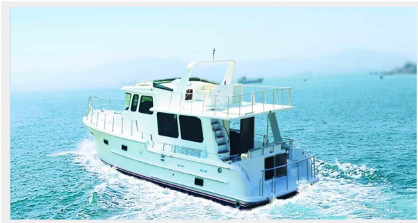
PS Stern view