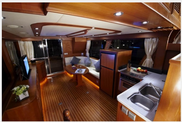
Lounge to stern