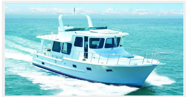
SB Bow view