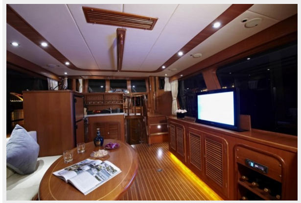
Lounge to forward