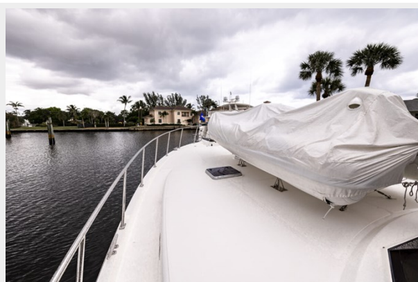
Foredeck / Tender Storage