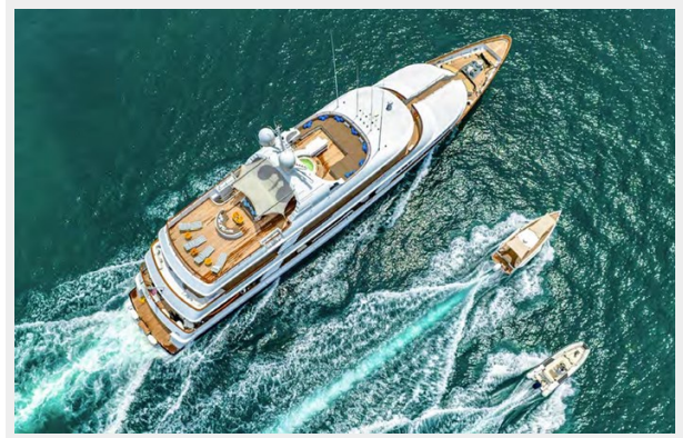
CRN in Navigation