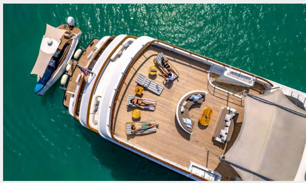
CRN Sun deck