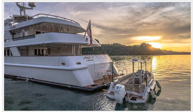
CRN Stern + Tender