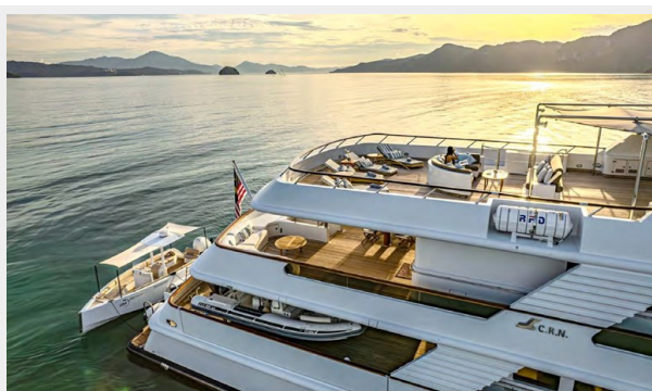
CRN Side View