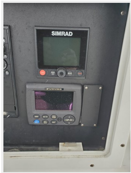
New autopilot Furuno