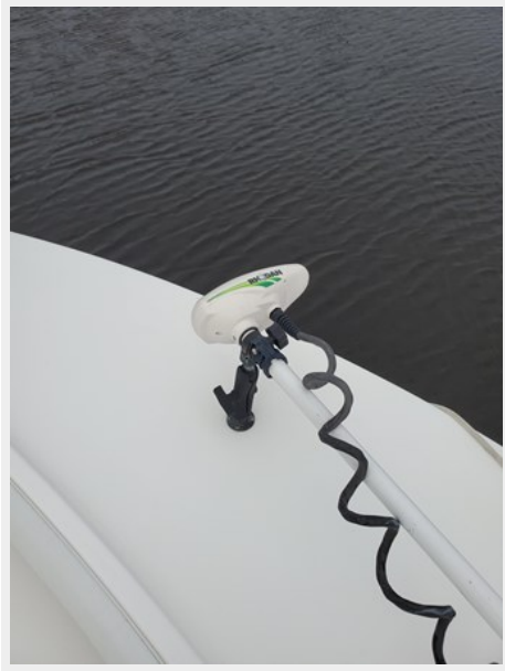
Rhodan trolling motor