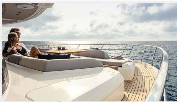
BOW AREA 2