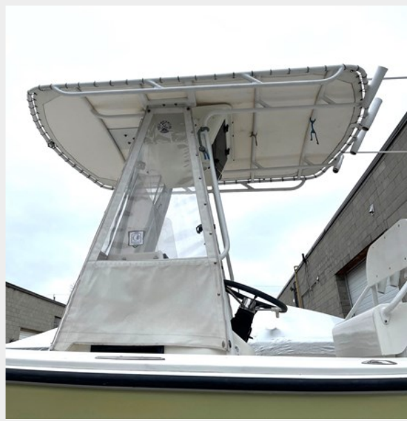
Console & T-top canvas IMG_2210