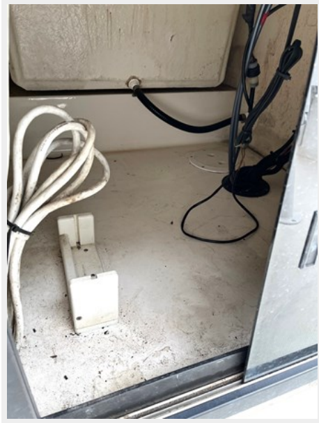
Console - stowage under dash IMG_2214