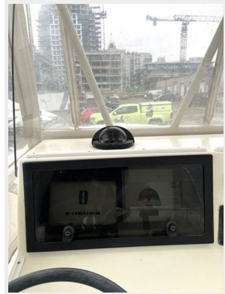
Console at helm IMG_2212