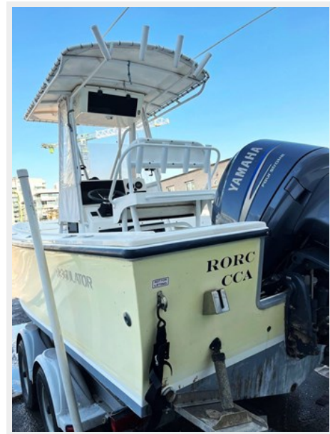
Port quarter IMG_2163