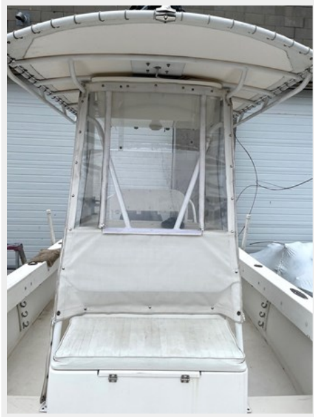
Console seat-locker fwd IMG_2223