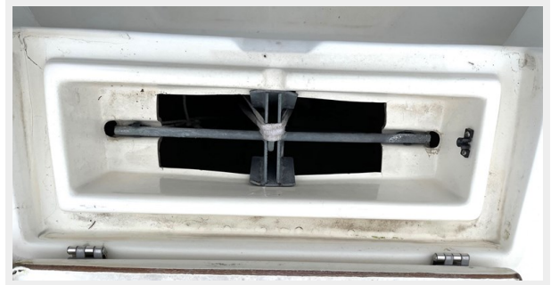
Anchor in locker IMG_2225