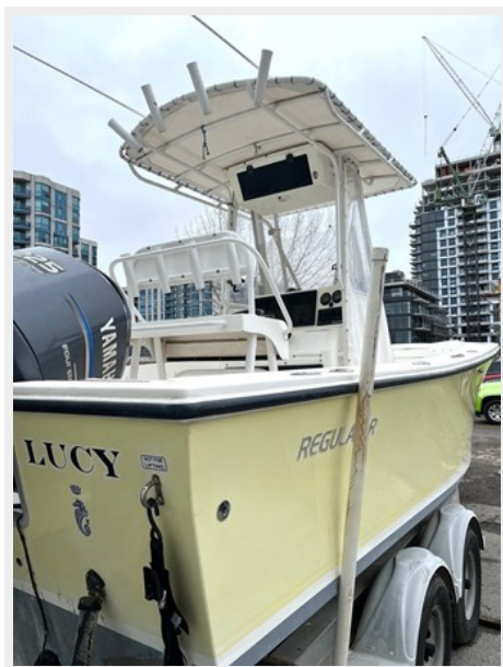
Stbd quarter profile IMG_2209