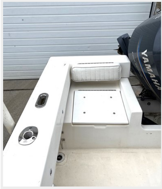
Seat above battery locker - stbd IMG_2219