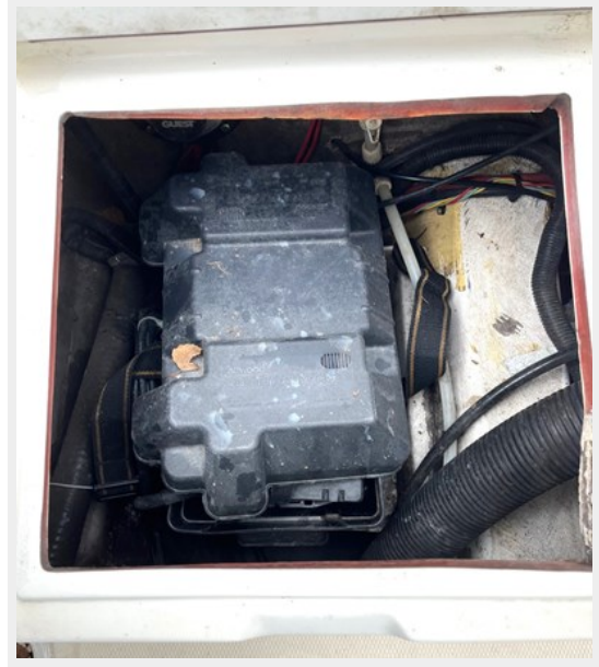
Battery - stbd aft IMG_2218