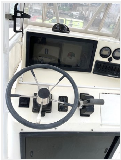
Console - helm IMG_2213