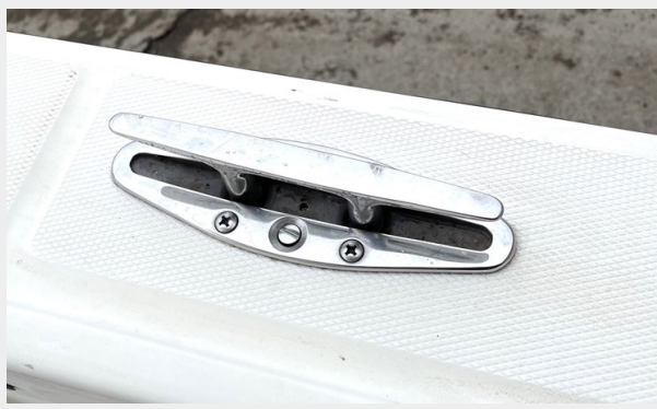
Pop-up midships cleat - stbd IMG_2220