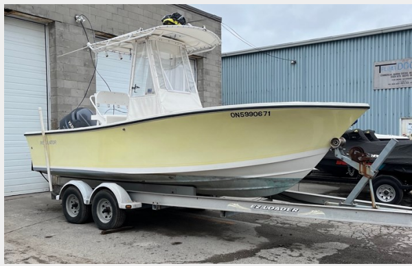
Stbd profile IMG_2207