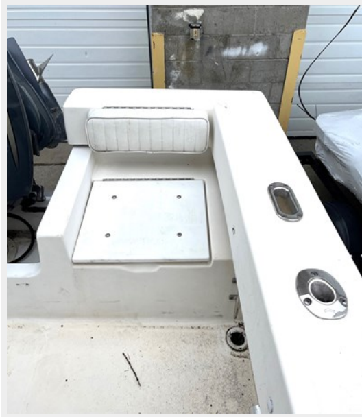
Seat above battery locker - port IMG_2217