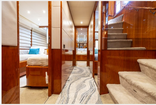
100 Azimut 1999_Tom Robertson_63