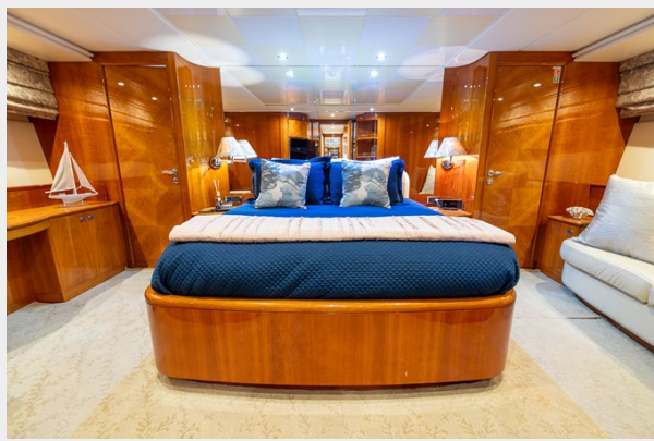
100 Azimut 1999_Tom Robertson_56