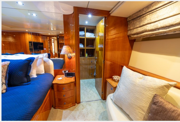
100 Azimut 1999_Tom Robertson_61