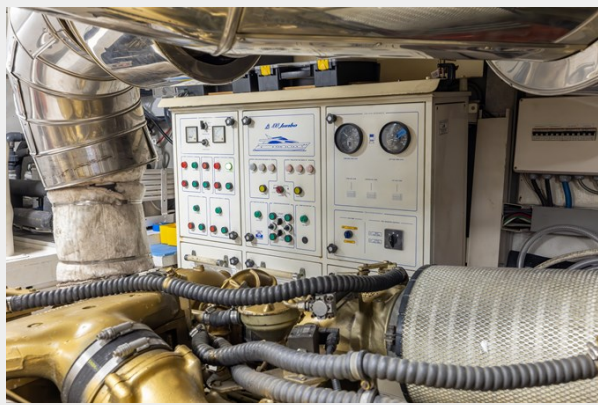
100 Azimut 1999_Tom Robertson_13