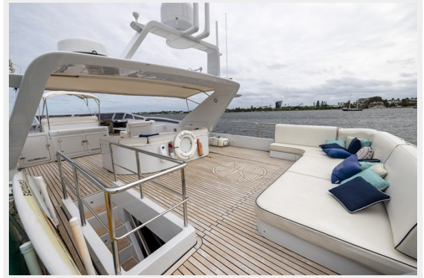
100 Azimut 1999_Tom Robertson_26