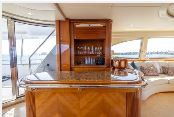
100 Azimut 1999_Tom Robertson_39