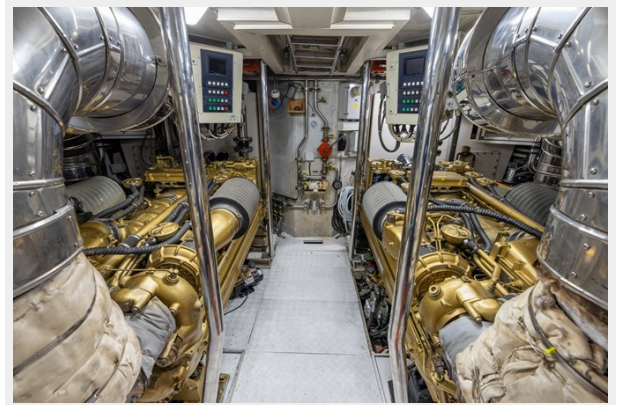
100 Azimut 1999_Tom Robertson_12