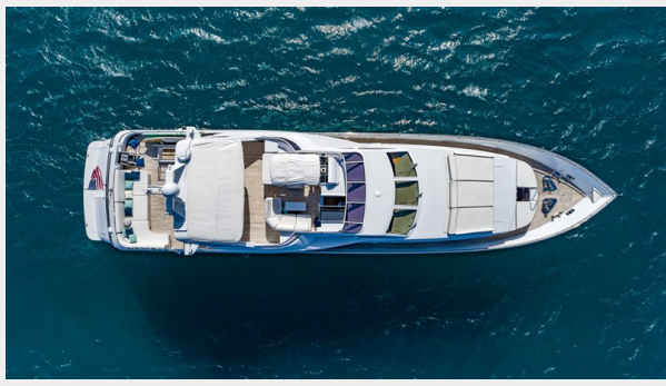
100 Azimut 1999_Tom Robertson_6