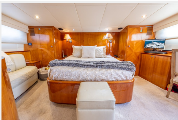
100 Azimut 1999_Tom Robertson_69