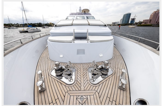
100 Azimut 1999_Tom Robertson_18