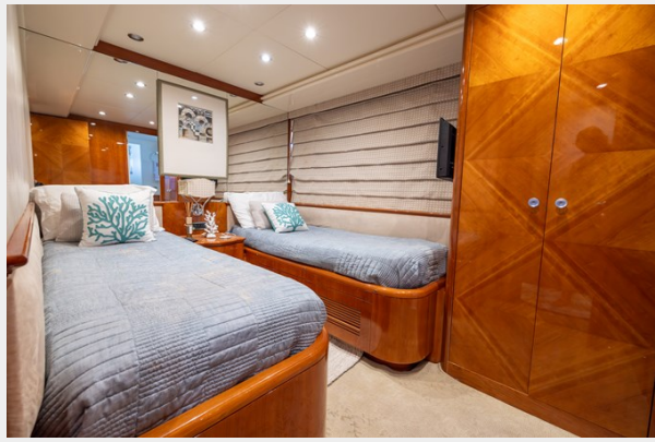
100 Azimut 1999_Tom Robertson_48