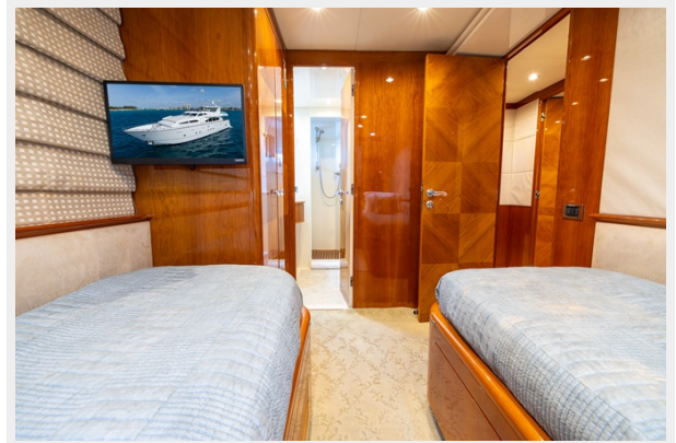
100 Azimut 1999_Tom Robertson_53