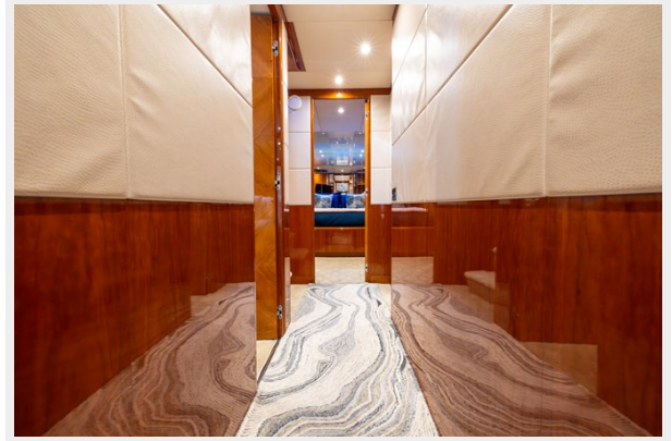
100 Azimut 1999_Tom Robertson_64