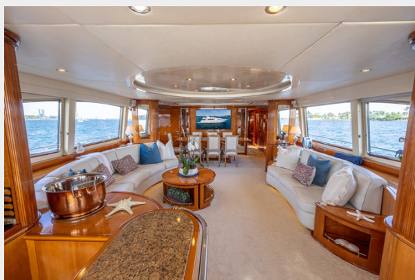
100 Azimut 1999_Tom Robertson_35