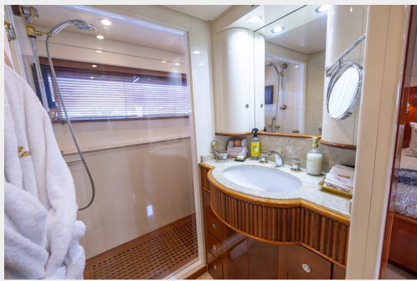
100 Azimut 1999_Tom Robertson_68