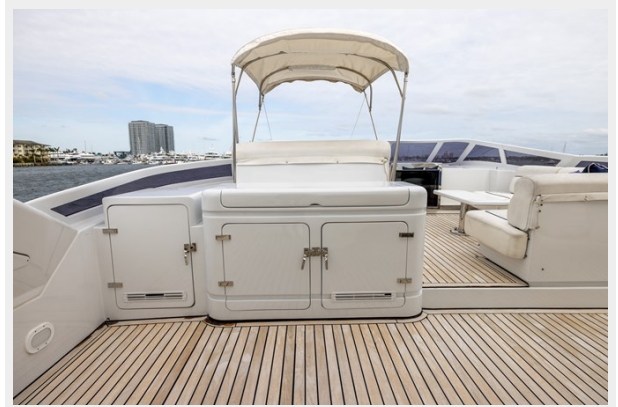
100 Azimut 1999_Tom Robertson_28