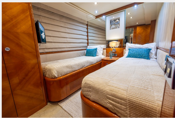
100 Azimut 1999_Tom Robertson_54