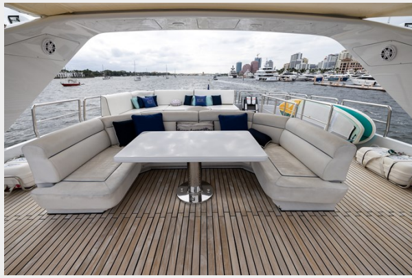
100 Azimut 1999_Tom Robertson_25