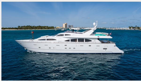
100 Azimut 1999_Tom Robertson_5