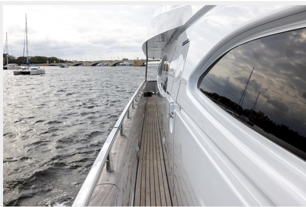
100 Azimut 1999_Tom Robertson_21