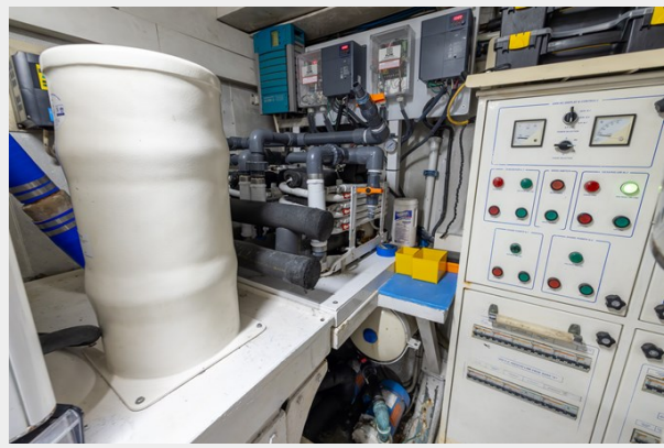
100 Azimut 1999_Tom Robertson_16