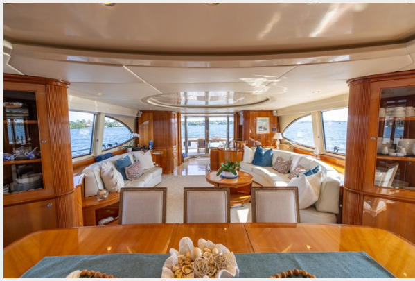
100 Azimut 1999_Tom Robertson_34