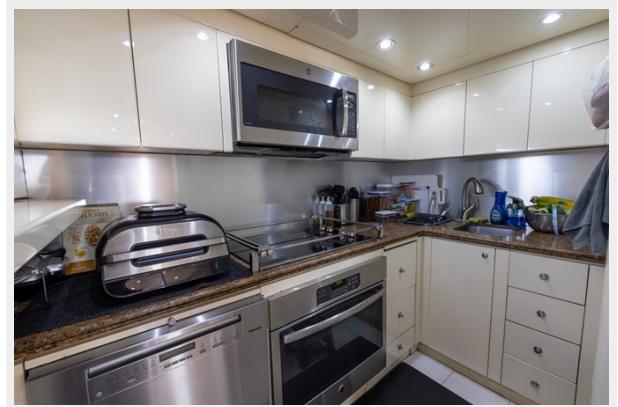
100 Azimut 1999_Tom Robertson_41