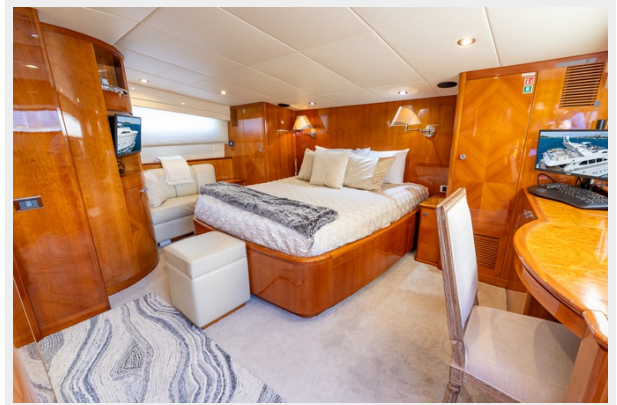
100 Azimut 1999_Tom Robertson_65