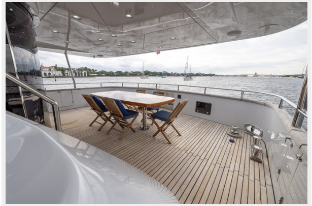
100 Azimut 1999_Tom Robertson_24