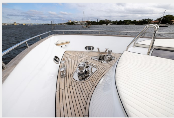
100 Azimut 1999_Tom Robertson_19