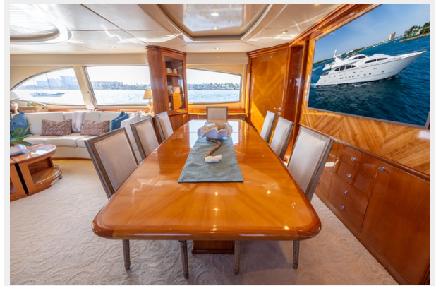
100 Azimut 1999_Tom Robertson_36