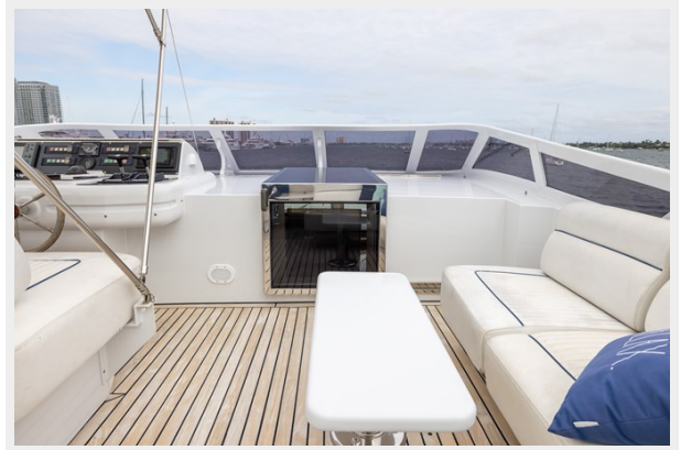
100 Azimut 1999_Tom Robertson_32