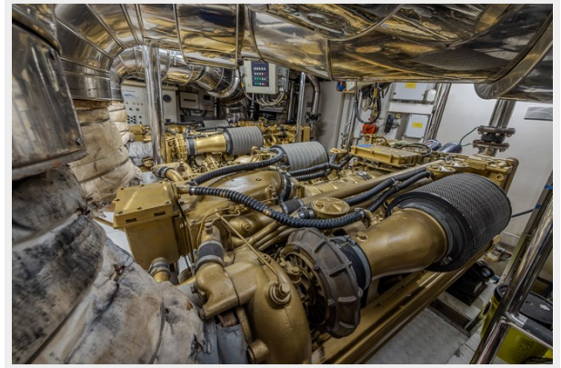
100 Azimut 1999_Tom Robertson_10