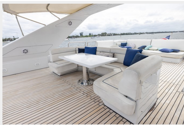
100 Azimut 1999_Tom Robertson_33