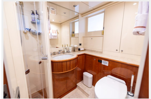
100 Azimut 1999_Tom Robertson_49