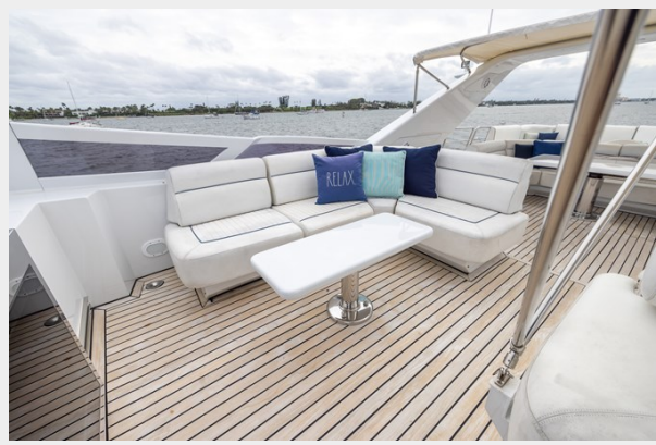
100 Azimut 1999_Tom Robertson_31