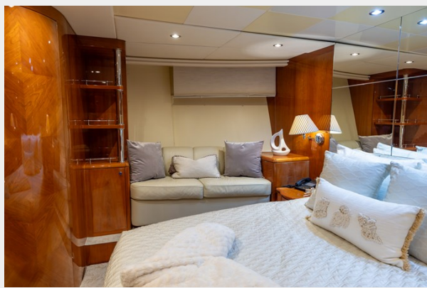
100 Azimut 1999_Tom Robertson_50