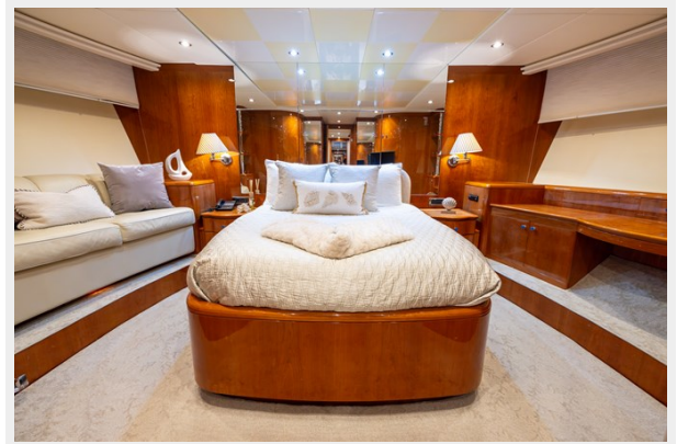
100 Azimut 1999_Tom Robertson_51