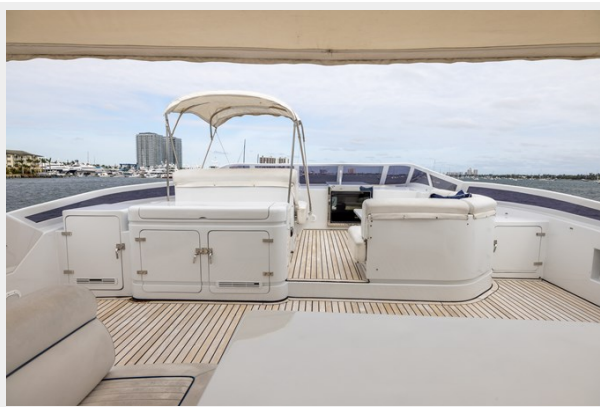
100 Azimut 1999_Tom Robertson_29