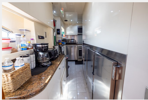
100 Azimut 1999_Tom Robertson_40