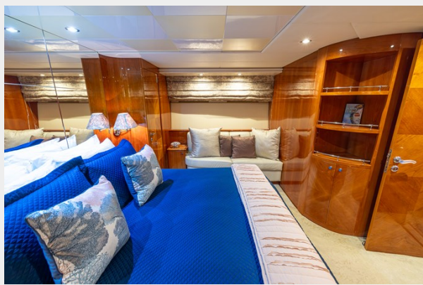
100 Azimut 1999_Tom Robertson_58