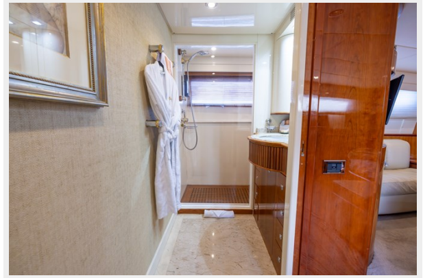
100 Azimut 1999_Tom Robertson_67