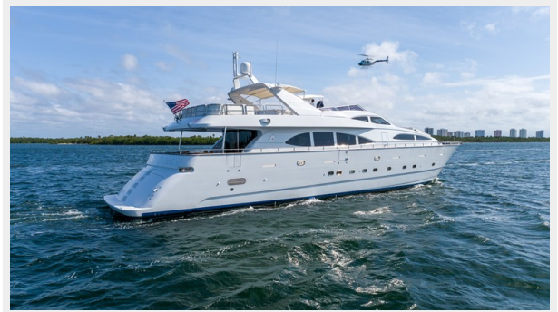
100 Azimut 1999_Tom Robertson_9