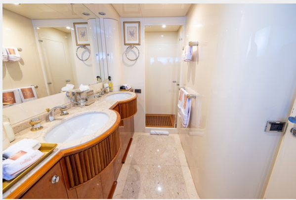
100 Azimut 1999_Tom Robertson_59