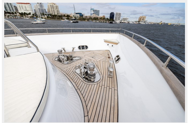
100 Azimut 1999_Tom Robertson_20