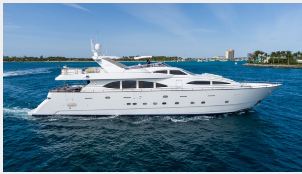
100 Azimut 1999_Tom Robertson_4