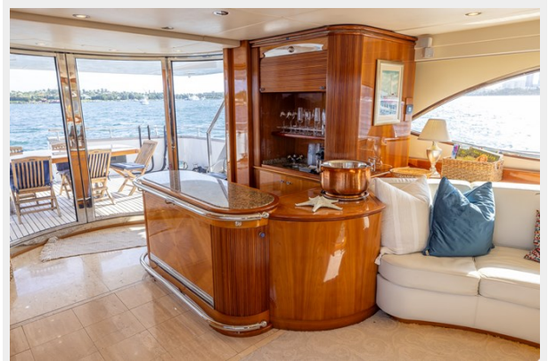
100 Azimut 1999_Tom Robertson_38