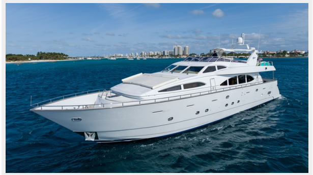
100 Azimut 1999_Tom Robertson_7