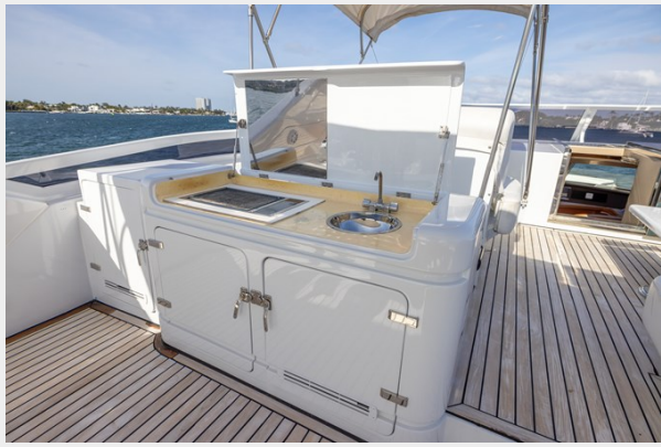
100 Azimut 1999_Tom Robertson_46