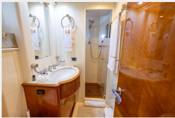
100 Azimut 1999_Tom Robertson_52