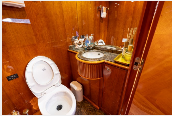
100 Azimut 1999_Tom Robertson_66