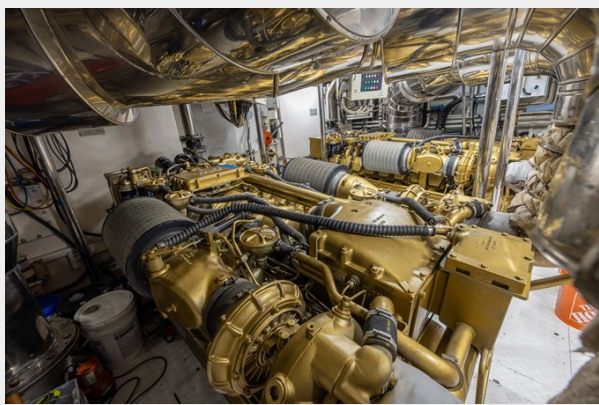
100 Azimut 1999_Tom Robertson_14