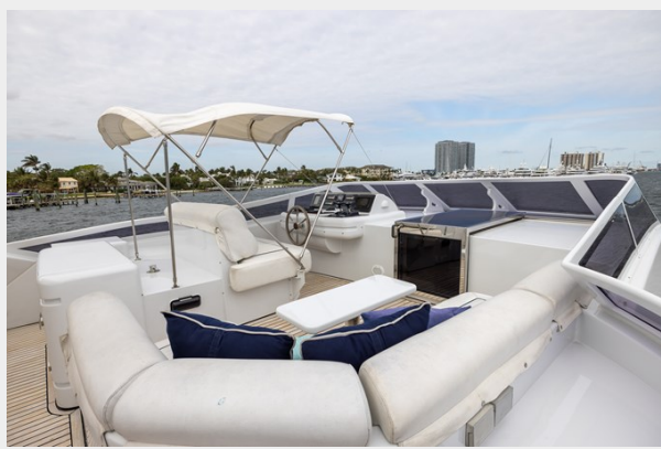
100 Azimut 1999_Tom Robertson_27