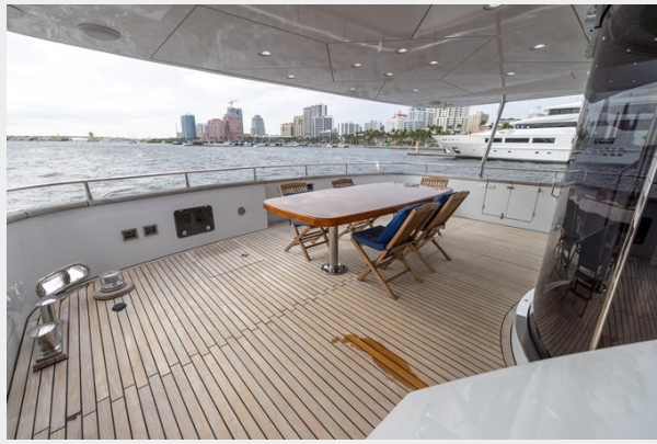
100 Azimut 1999_Tom Robertson_23