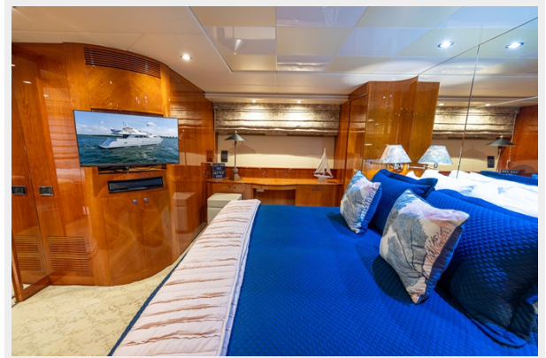
100 Azimut 1999_Tom Robertson_57