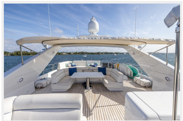
100 Azimut 1999_Tom Robertson_43