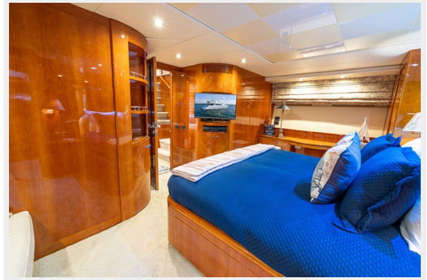
100 Azimut 1999_Tom Robertson_62