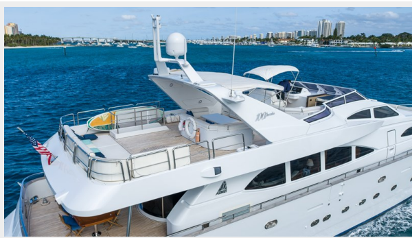
100 Azimut 1999_Tom Robertson_2