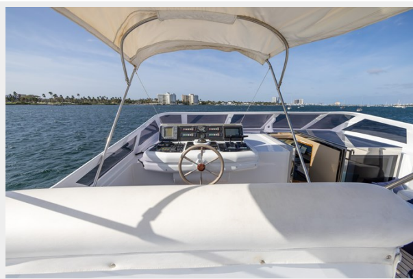
100 Azimut 1999_Tom Robertson_44