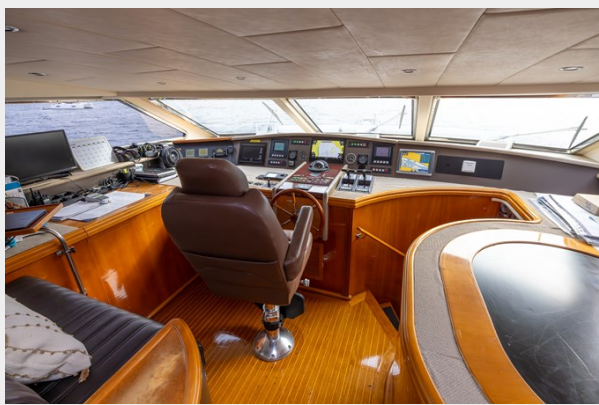
100 Azimut 1999_Tom Robertson_1