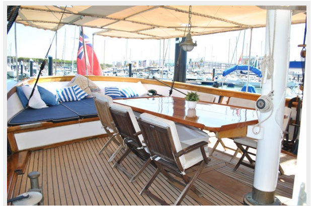
Aft Deck 1