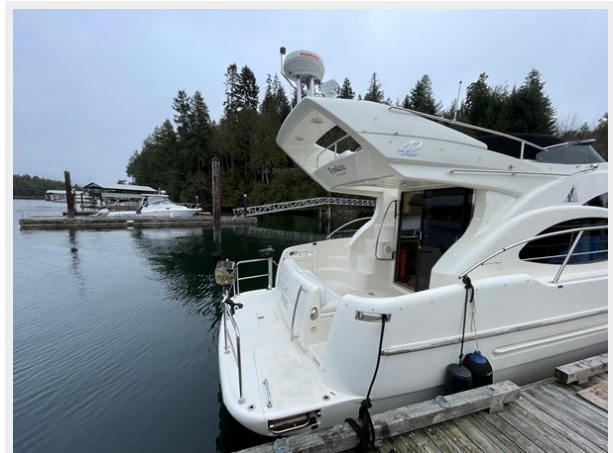
Cockpit, Swim Step, Staple Rails