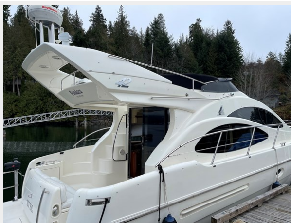
Stairs to Flybridge