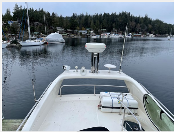
Flybridge looking aft, liferaft