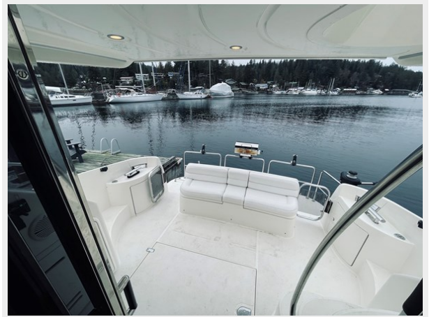
Cockpit looking aft, dual transom gates