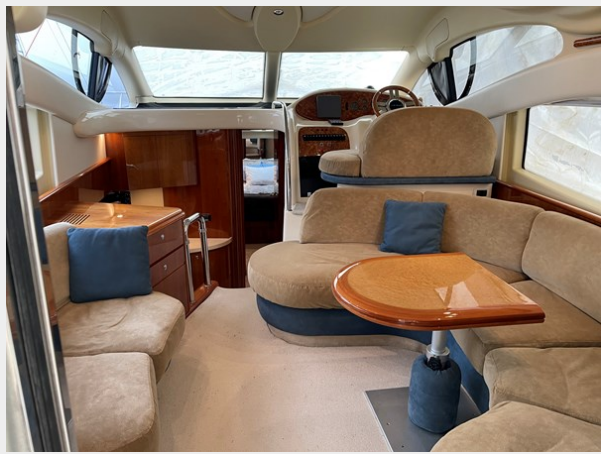
Salon looking forward