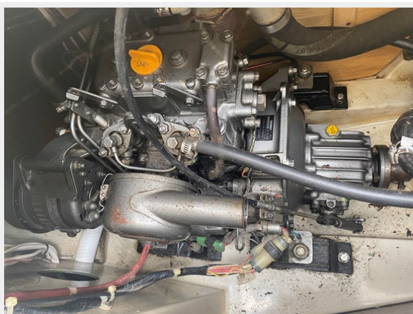
1984 Mirage 30 (68)