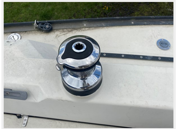
1984 Mirage 30 (93)