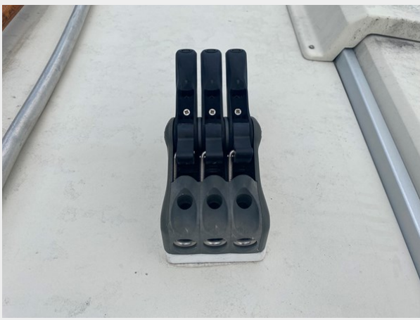
1984 Mirage 30 (91)