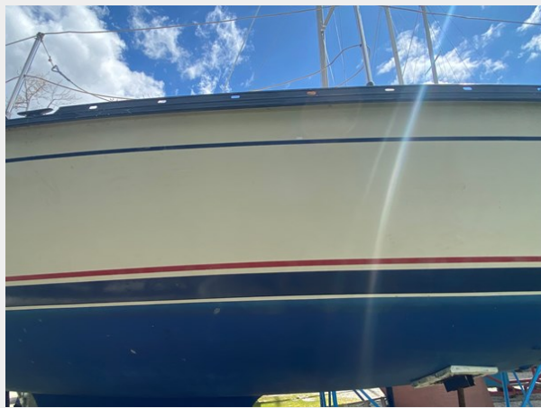
1984 Mirage 30 (10)