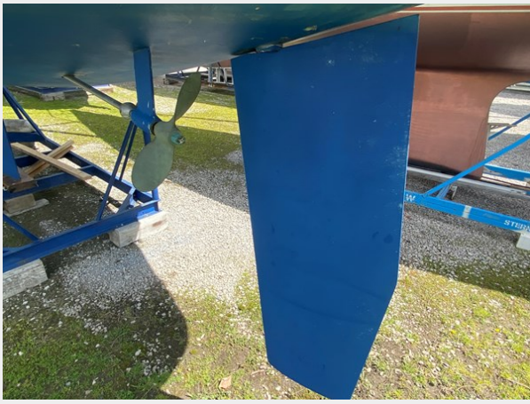
1984 Mirage 30 (78)