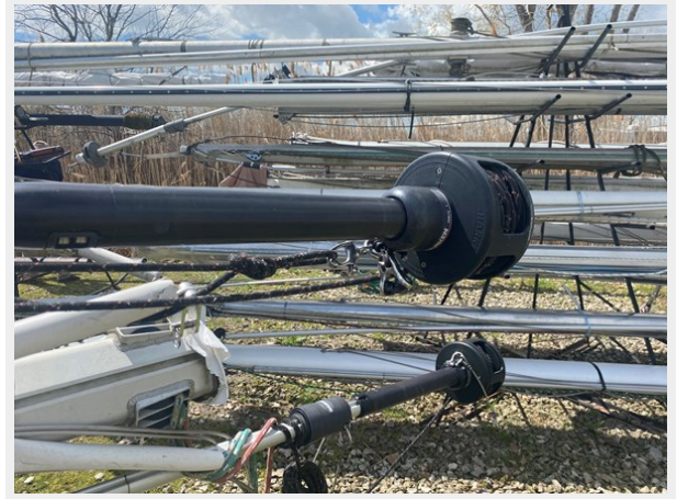
1984 Mirage 30 (82)