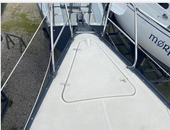
1984 Mirage 30 (100)