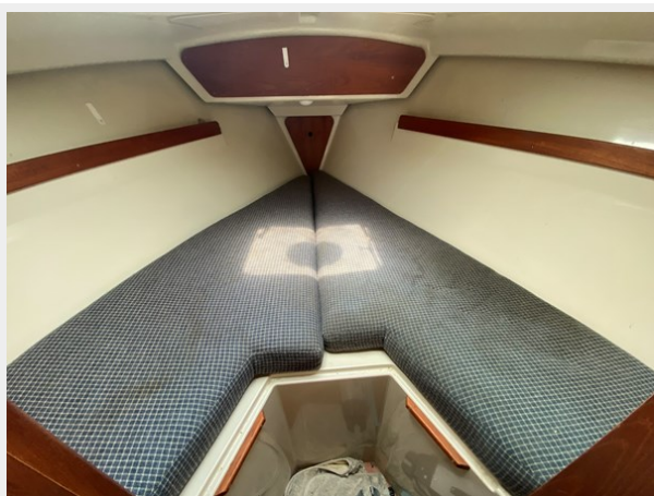
1984 Mirage 30 (52)