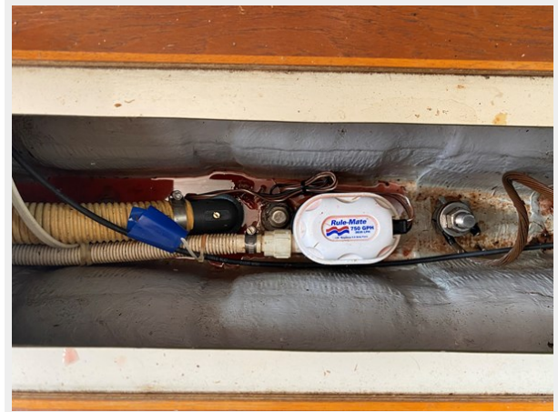
1984 Mirage 30 (49)