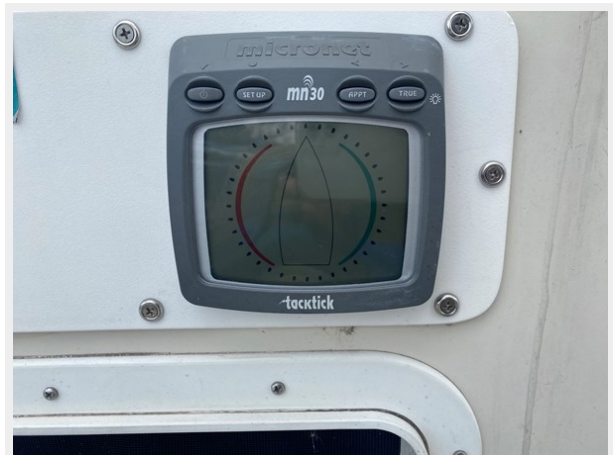
1984 Mirage 30 (54)