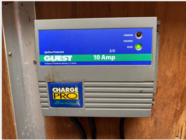
1984 Mirage 30 (111)