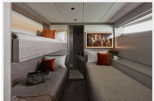
Guest Twin Stateroom