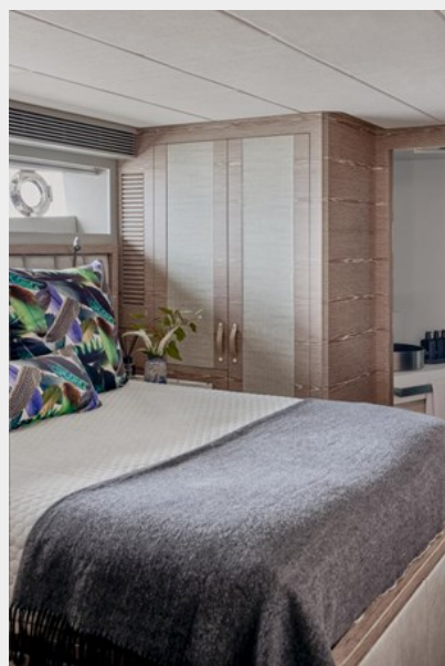
VIP Stateroom 2