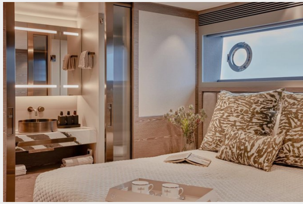
VIP Stateroom 1 and Head