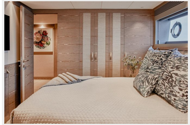
VIP Stateroom 1