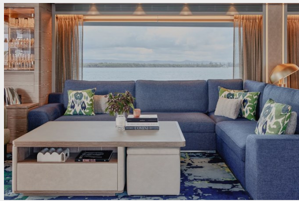
Salon and Coffee Table