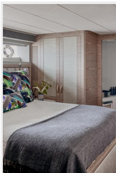
VIP Stateroom 2