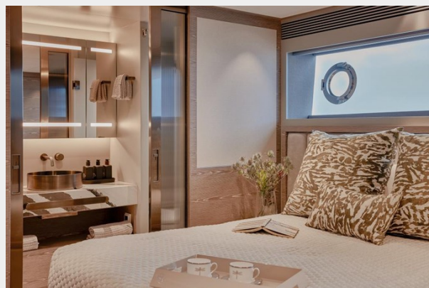
VIP Stateroom 1 and Head