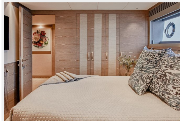
VIP Stateroom 1