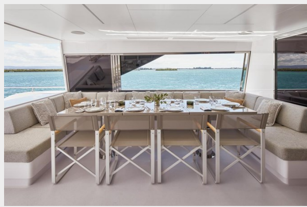
Dining Upper Deck