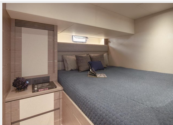
Crew Cabin 1