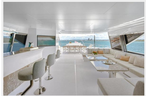
Bar Upper Deck