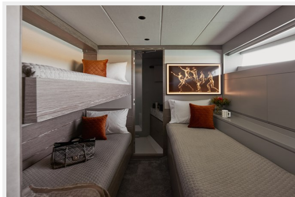
Guest Twin Stateroom