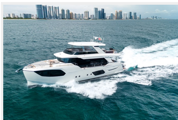
DJI_20231013131716_0039_D - Copy