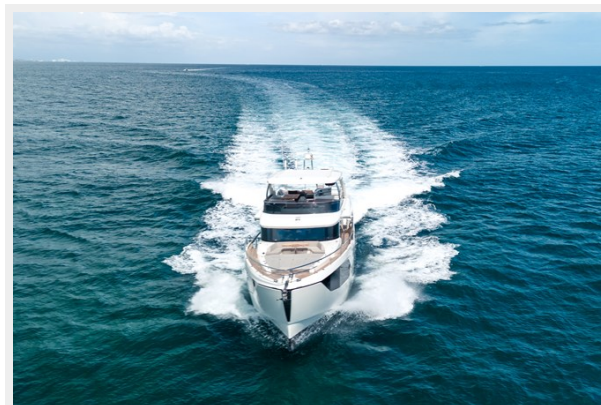
DJI_20231013131605_0027_D - Copy