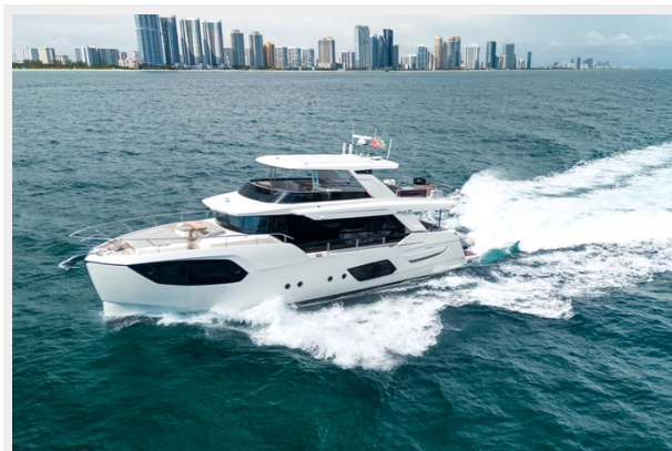
DJI_20231013131716_0039_D - Copy