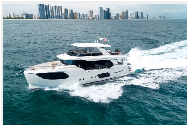
DJI_20231013131716_0039_D - Copy