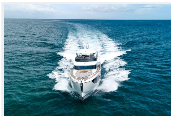
DJI_20231013131605_0027_D - Copy