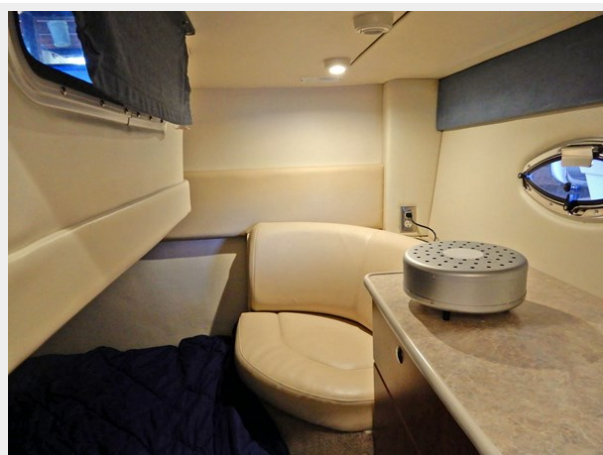
Bayliner 325 Aft Cabin