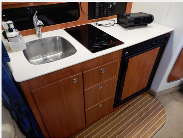
Bayliner 325 Galley