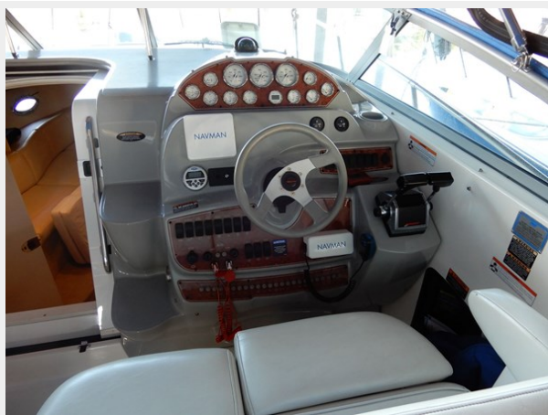
Bayliner 325 Helm