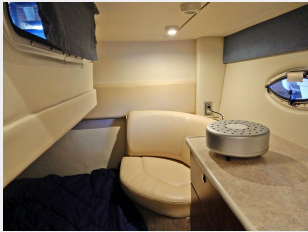
Bayliner 325 Aft Cabin