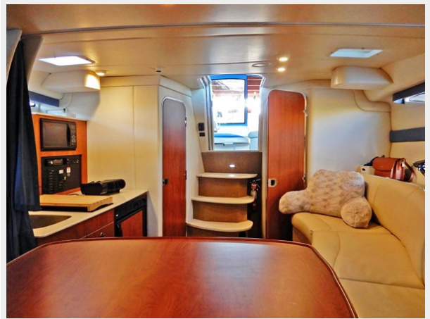
Bayliner 325 LA