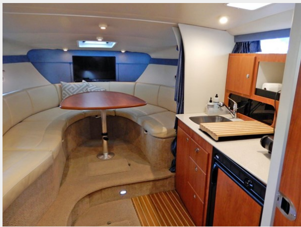
Bayliner 325 LF