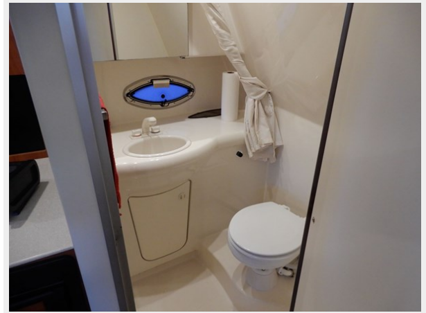
Bayliner 325 Head