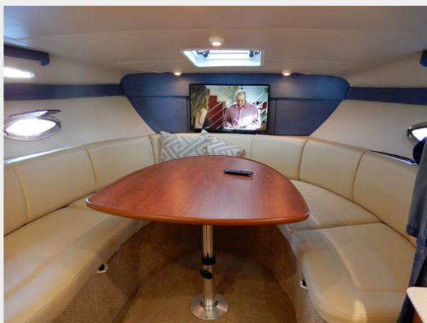
Bayliner 325 Salon Table