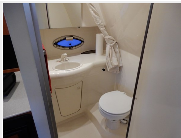
Bayliner 325 Head