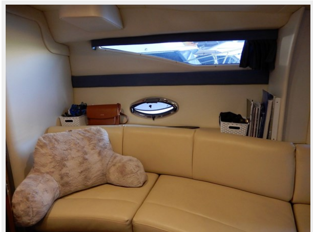
Bayliner 325 Salon