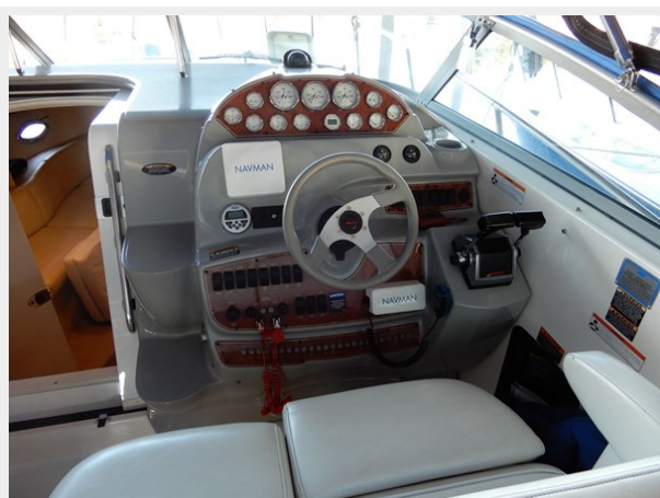
Bayliner 325 Helm