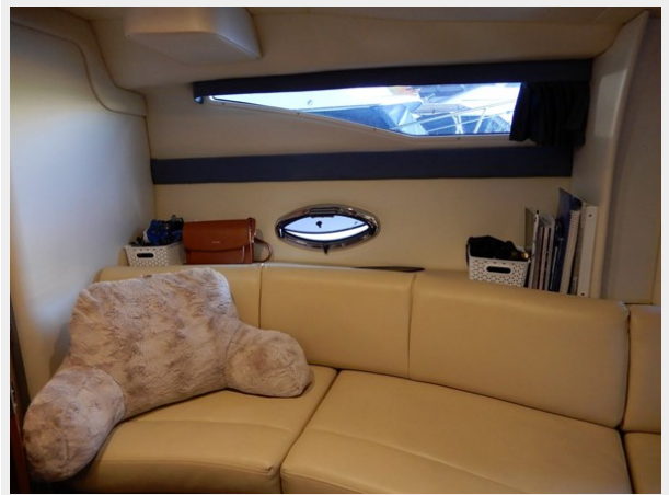
Bayliner 325 Salon