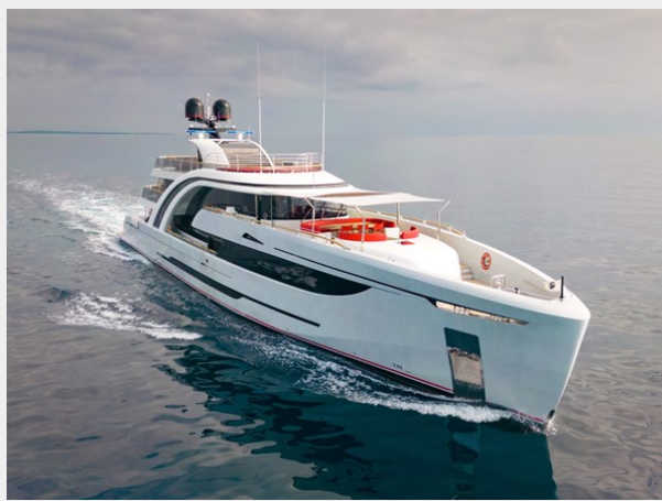
Mayra 50m EUPHORIA II 1