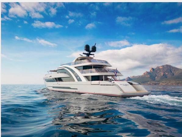
Mayra 50m EUPHORIA II 15