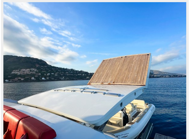
Mayra 50m EUPHORIA II 16