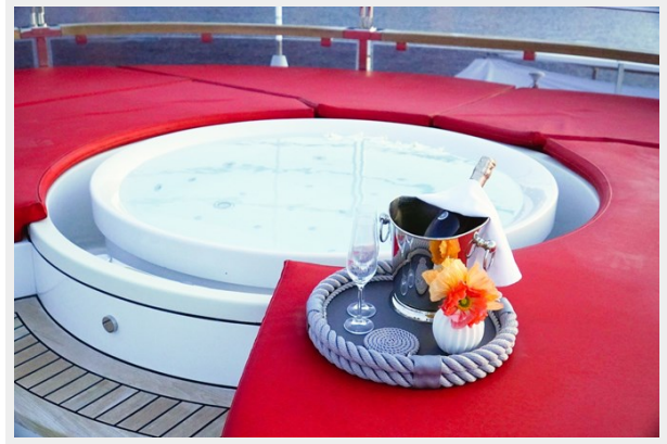
Mayra 50m EUPHORIA II 20