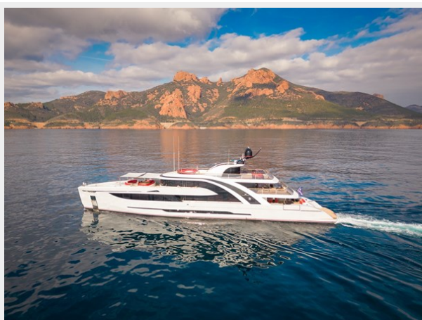
Mayra 50m EUPHORIA II 8