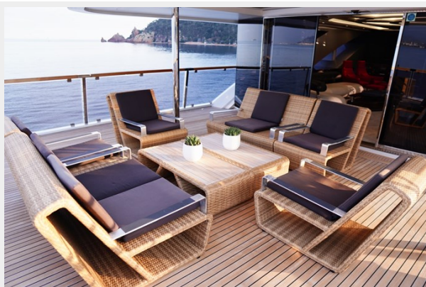
Mayra 50m EUPHORIA II 36