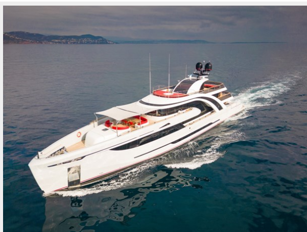
Mayra 50m EUPHORIA II 5