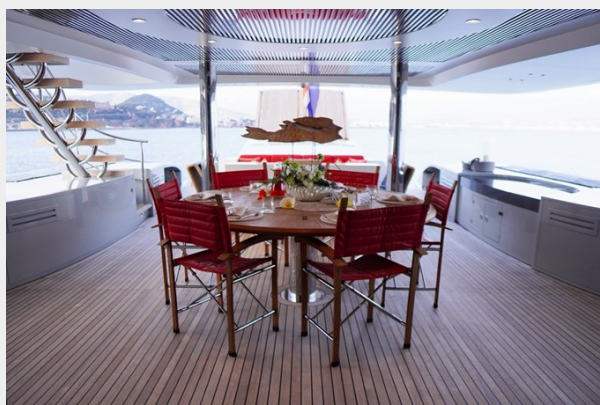
Mayra 50m EUPHORIA II 34