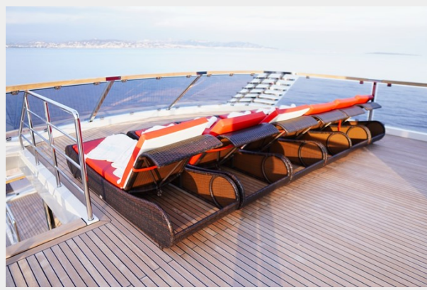
Mayra 50m EUPHORIA II 22