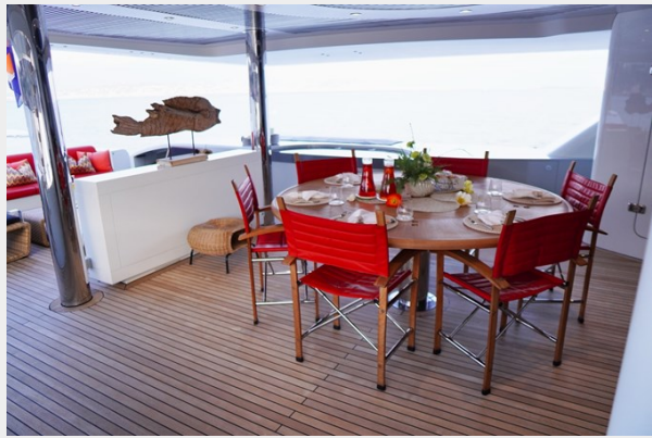
Mayra 50m EUPHORIA II 32