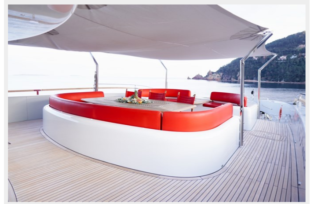
Mayra 50m EUPHORIA II 29