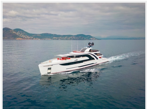
Mayra 50m EUPHORIA II 6