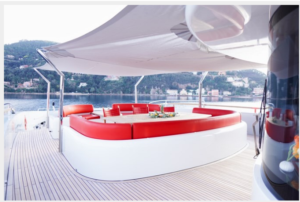
Mayra 50m EUPHORIA II 30