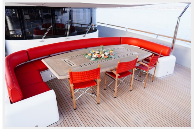
Mayra 50m EUPHORIA II 27