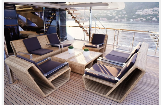
Mayra 50m EUPHORIA II 35