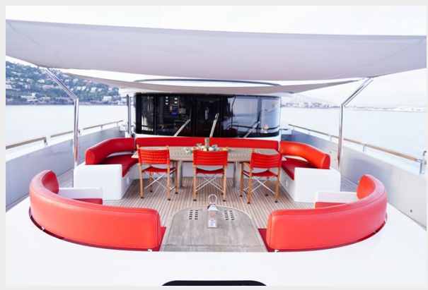
Mayra 50m EUPHORIA II 26