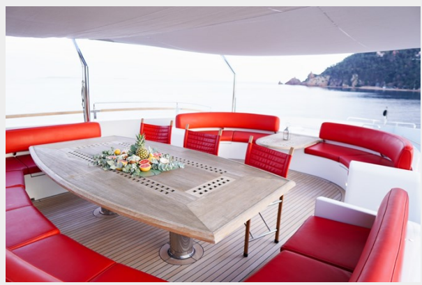
Mayra 50m EUPHORIA II 28