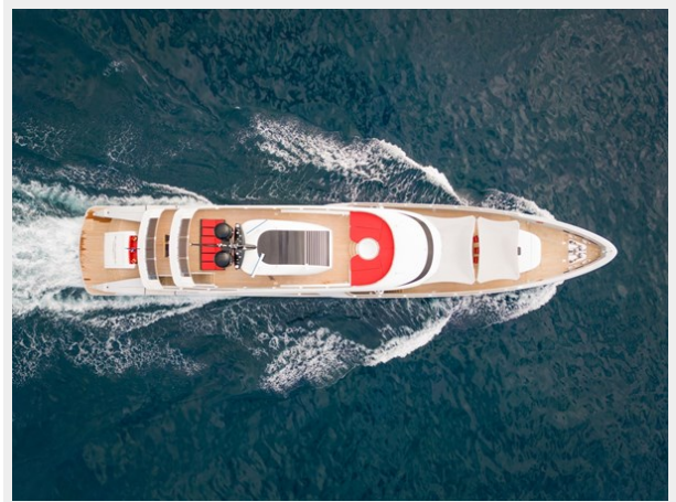
Mayra 50m EUPHORIA II 4