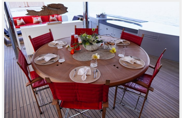
Mayra 50m EUPHORIA II 33