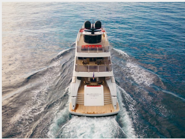
Mayra 50m EUPHORIA II 12