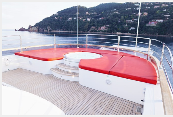
Mayra 50m EUPHORIA II 19