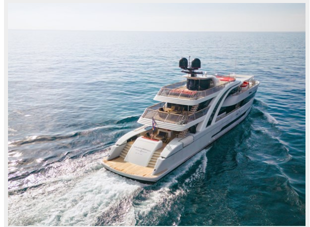
Mayra 50m EUPHORIA II 13