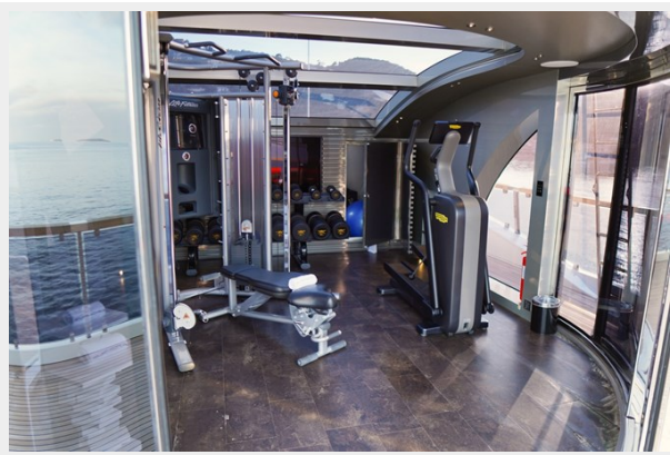
Mayra 50m EUPHORIA II 24