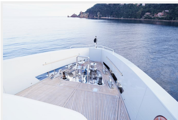
Mayra 50m EUPHORIA II 17