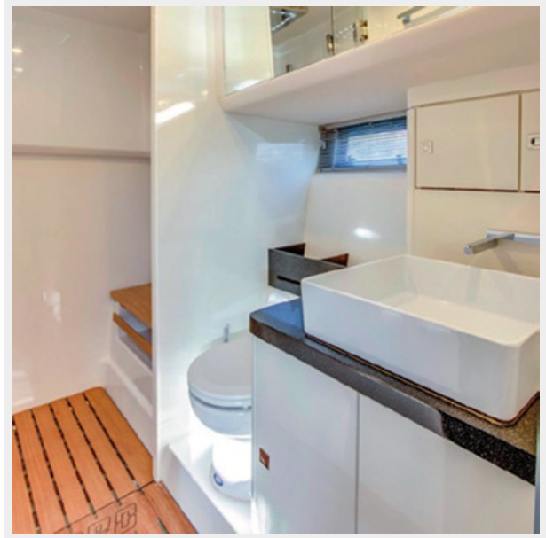
FJORD YACHTS MOORING 40 OPEN 2016 YACHT FOR SALE | INTERIOR (2)