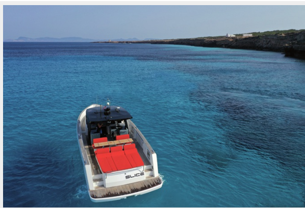
FJORD YACHTS MOORING 40 OPEN 2016 YACHT FOR SALE | EXTERIOR (3)