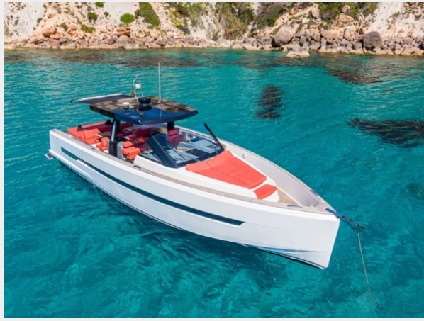
FJORD YACHTS MOORING 40 OPEN 2016 YACHT FOR SALE | EXTERIOR (1)