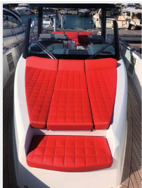
FJORD YACHTS MOORING 40 OPEN 2016 YACHT FOR SALE | EXTERIOR (8)