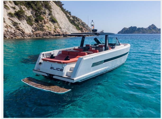
FJORD YACHTS MOORING 40 OPEN 2016 YACHT FOR SALE | EXTERIOR (2)