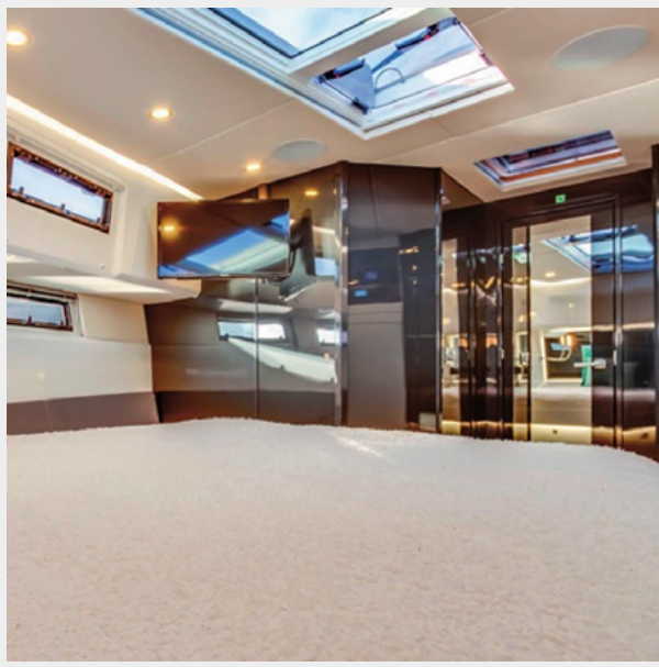
FJORD YACHTS MOORING 40 OPEN 2016 YACHT FOR SALE | INTERIOR (1)