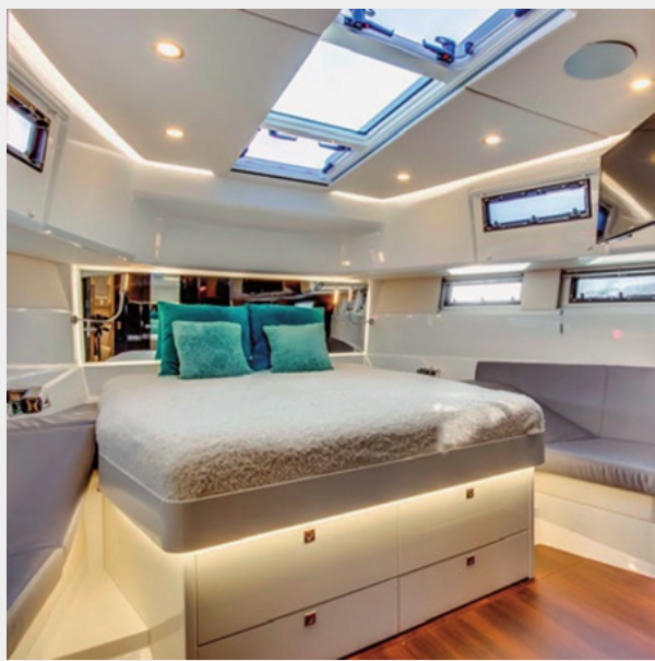
FJORD YACHTS MOORING 40 OPEN 2016 YACHT FOR SALE | INTERIOR (3)