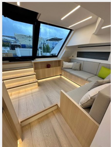
Lounge area 1