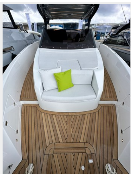
Bow sitting area