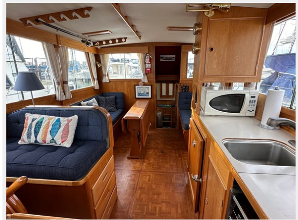
Grand Banks 36 LA