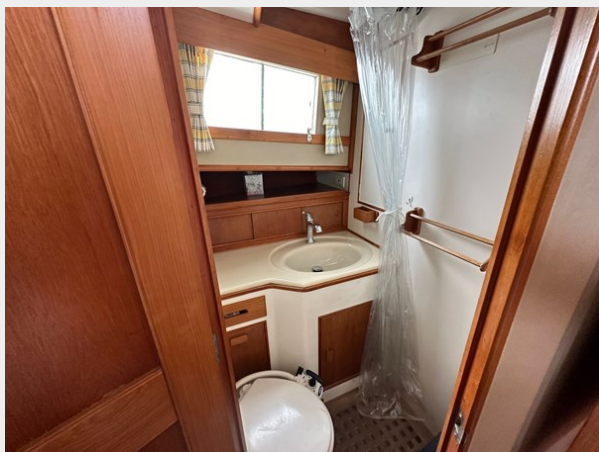
Grand Banks 36 Heads 2