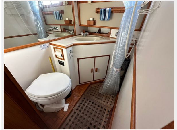
Grand Banks 36 Head