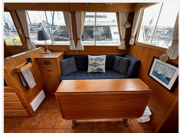
Grand Banks 36 Salon