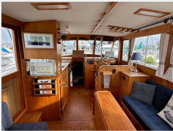
Grand Banks LF