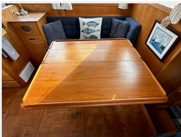
Grand Banks 36 Salon Table