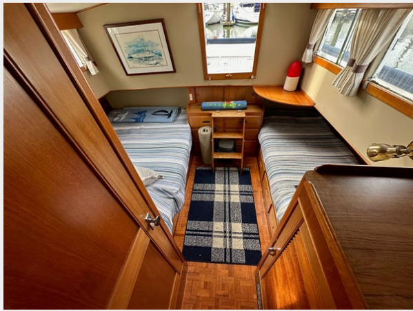
Grand Banks 36 Aft Cabin