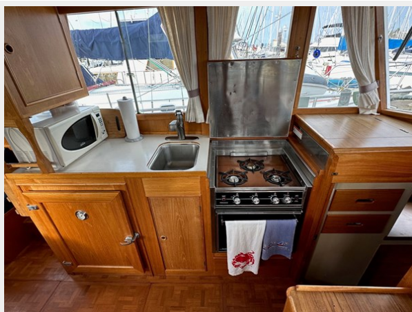
Grand Banks 36 - Galley