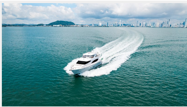
Fondue Studio - Dreamer II 48