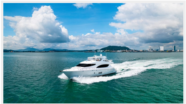
Fondue Studio - Dreamer II 54