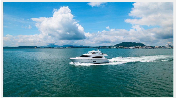
Fondue Studio - Dreamer II 52