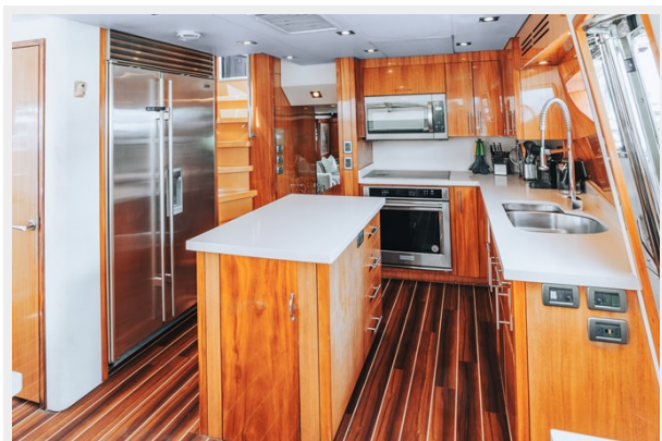
Fondue Studio - Dreamer II 23