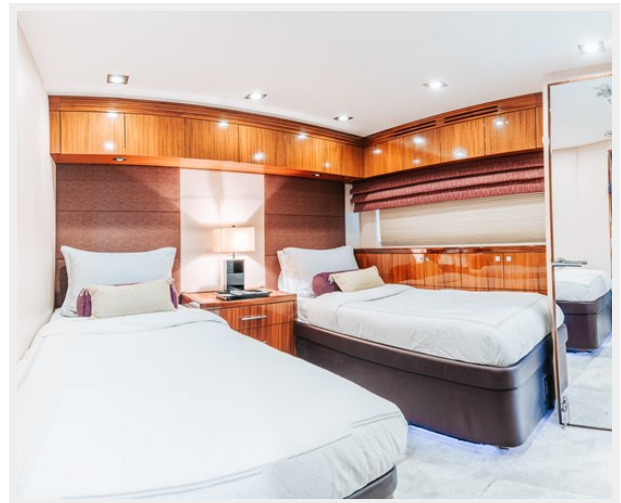
Fondue Studio - Dreamer II 31