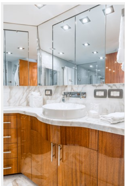
Fondue Studio - Dreamer II 28