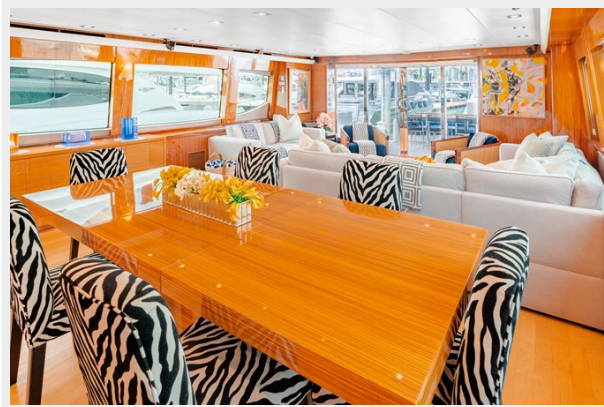
Fondue Studio - Dreamer II 17