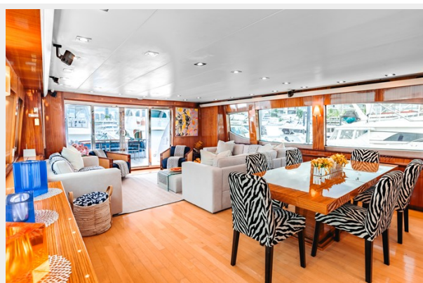
Fonduee Studio - Dreamer II 13