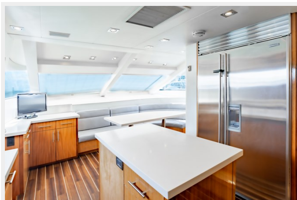
Fondue Studio - Dreamer II 21