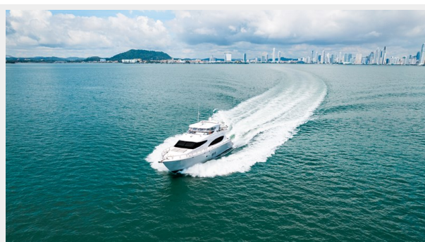
Fonduee Studio - Dreamer II 48