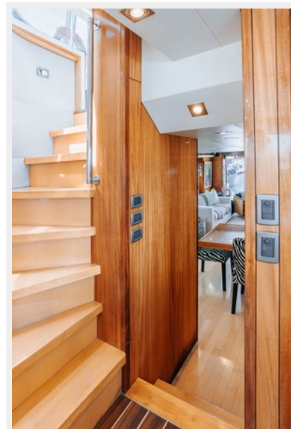
Fondue Studio - Dreamer II 20