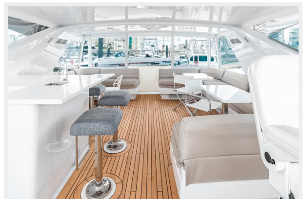
Fondue Studio - Dreamer II 2