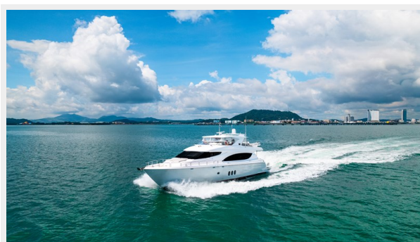
Fonduee Studio - Dreamer II 54