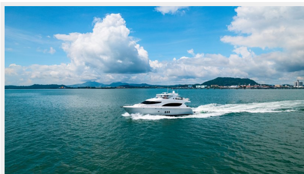
Fonduee Studio - Dreamer II 52