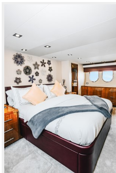
Fondue Studio - Dreamer II 25