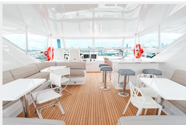
Fondue Studio - Dreamer II 1