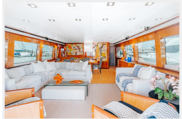
Fondue Studio - Dreamer II 20