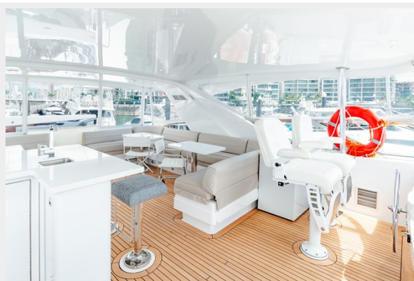
Fondue Studio - Dreamer II 5