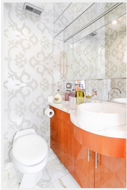
Fondue Studio - Dreamer II 29a