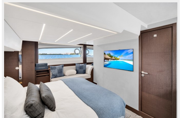
_DSC7496 Large - Copy