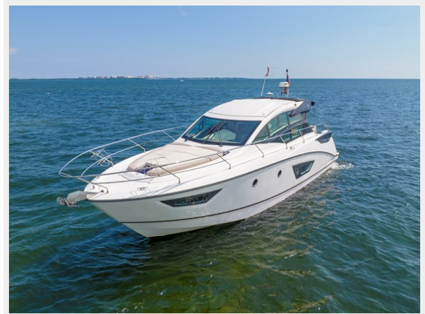
3 - Copy (2) - Copy