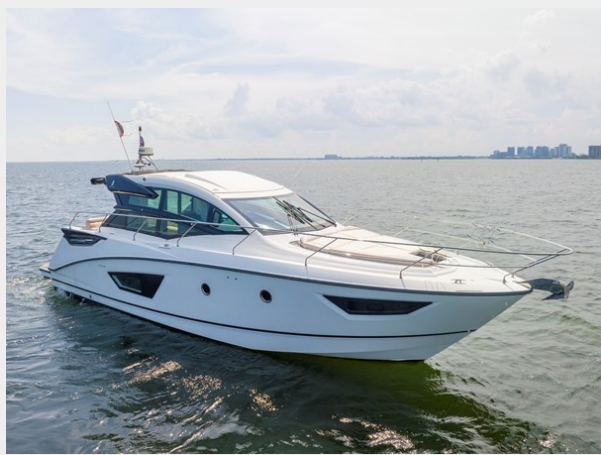
2 - Copy - Copy