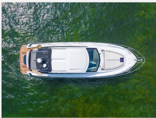
4 - Copy (2)