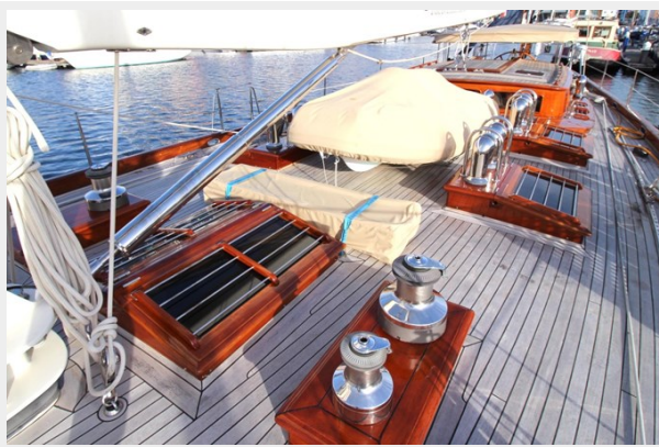
Hoek truly Classic 75 8