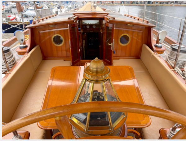
Hoek truly Classic 75 6