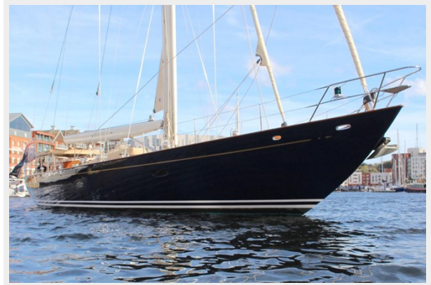
Hoek truly Classic 75 7