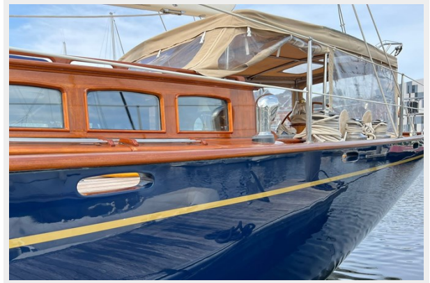
Hoek truly Classic 75 12