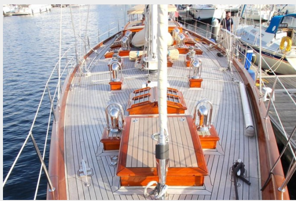
Hoek truly Classic 75 13