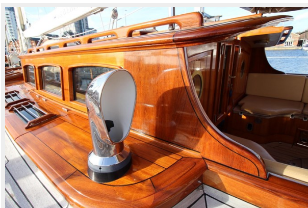
Hoek truly Classic 75 4