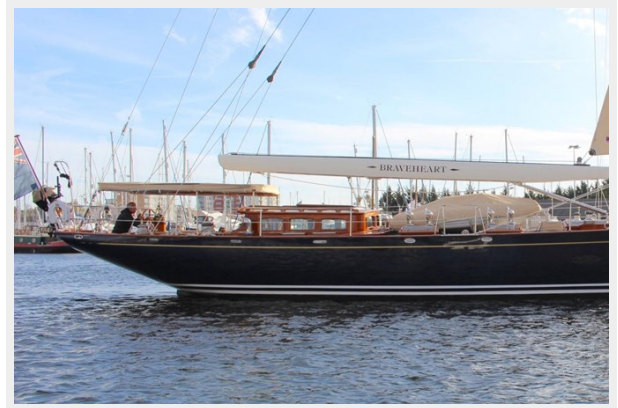
Hoek truly Classic 75 1