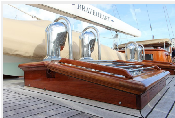
Hoek truly Classic 75 2