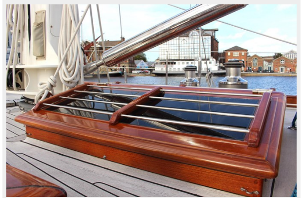
Hoek truly Classic 75 14