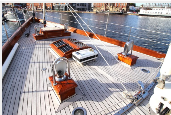
Hoek truly Classic 75 15