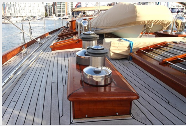
Hoek truly Classic 75 11