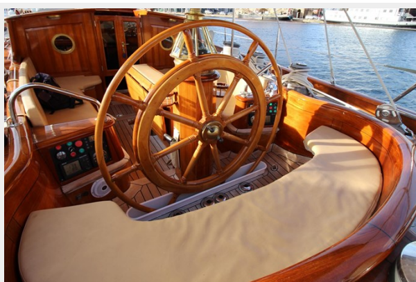
Hoek truly Classic 75 9