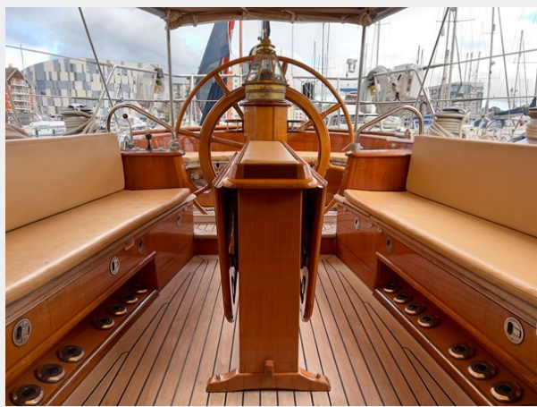
Hoek truly Classic 75