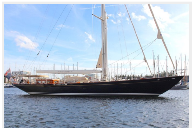
Hoek truly Classic 75 3