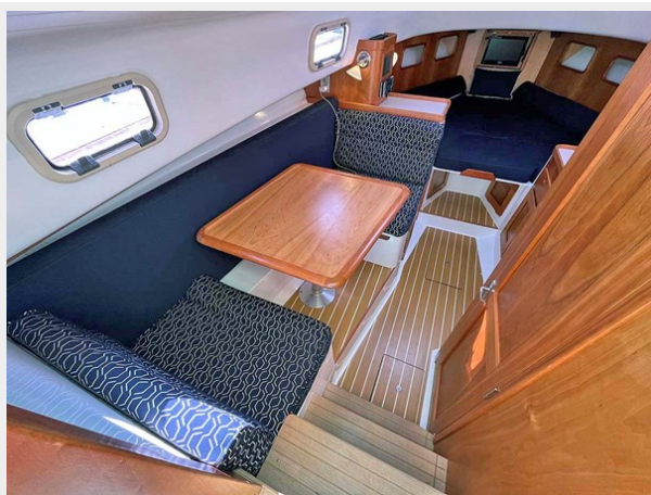
Convertible Dinette Looking Forward