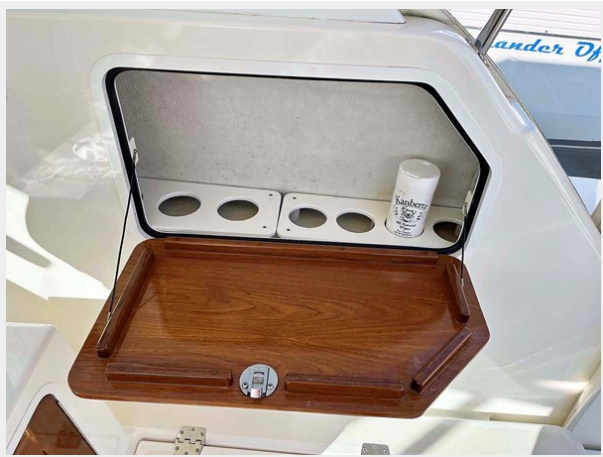
Bridgedeck Cubby and Fold Down Table