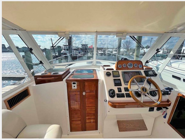
Helm and Companionway