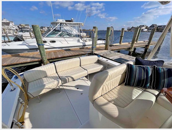
Cockpit Looking Aft