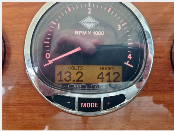
Current Engine Hours