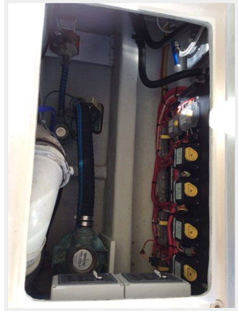
Engine Room, Day Hatch Access