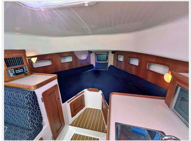
V-Berth Looking Forward