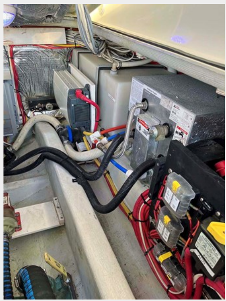
Starboard Engine Room