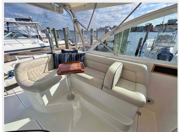
L-Settee w Removable Bolster