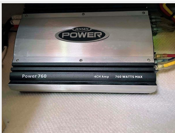
Jensen 760W Amplifier