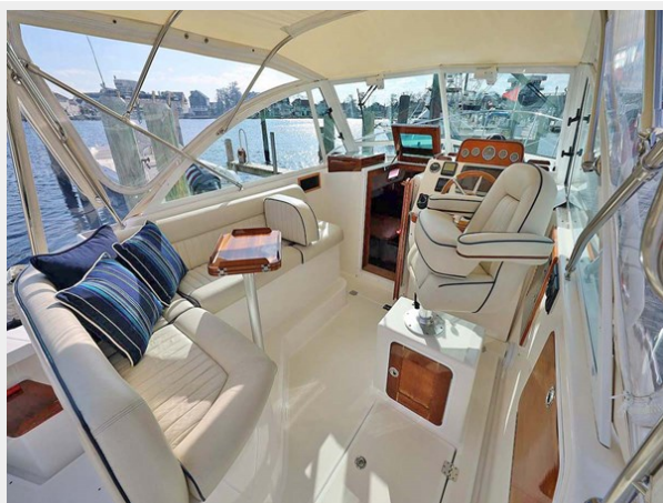
Bridge Deck Forward to Port