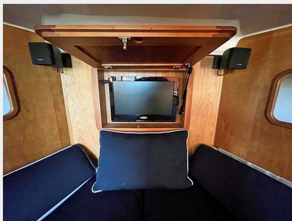
Recessed Flatscreen TV