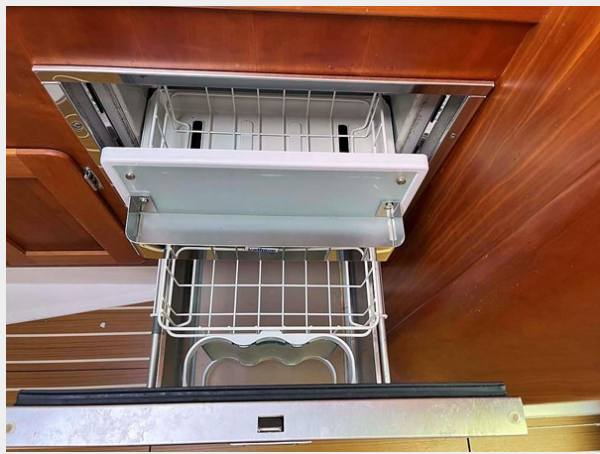
Galley Reeper Detail