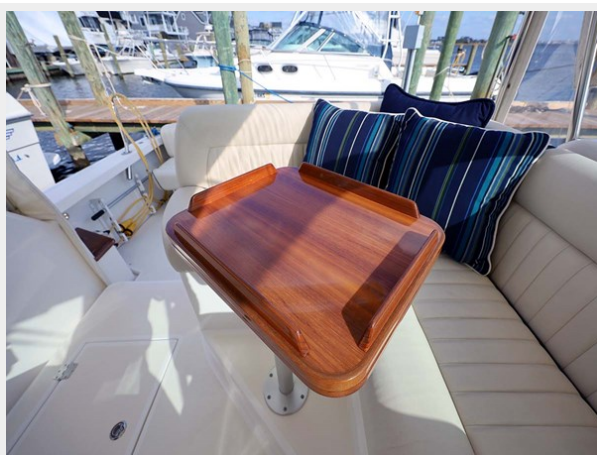
Bridge Deck Table Detail View