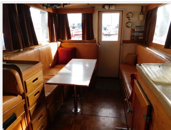
Grand Banks 32 - Looking Aft