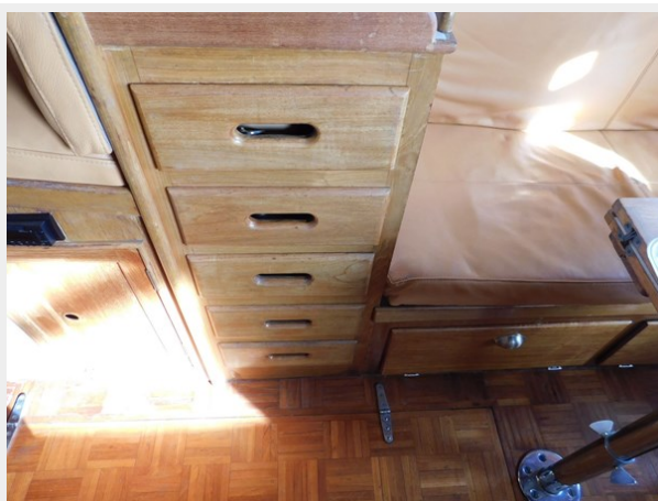
Grand Banks 32 Salon Storage