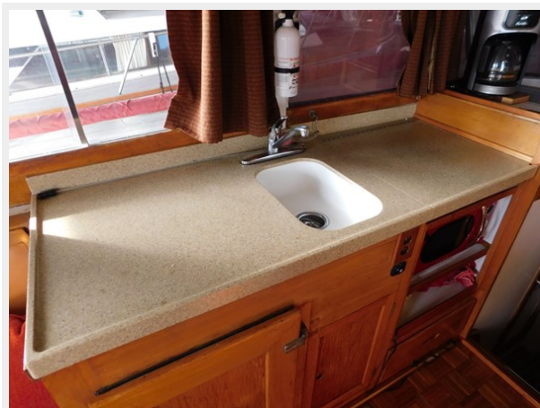
Grand Banks - Galley