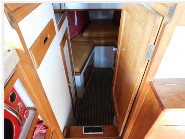
Grand Banks 32 Forward Cabin