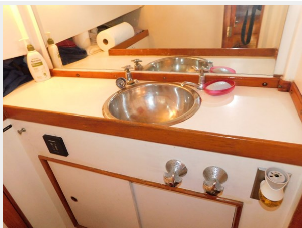
Grand Banks - Head