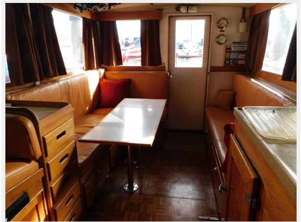
Grand Banks 32 - Looking Aft