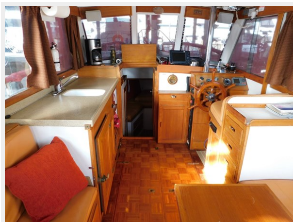
Grand Banks 32 - Looking Forward