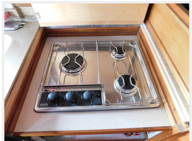
Grand Banks 32 Cocktop