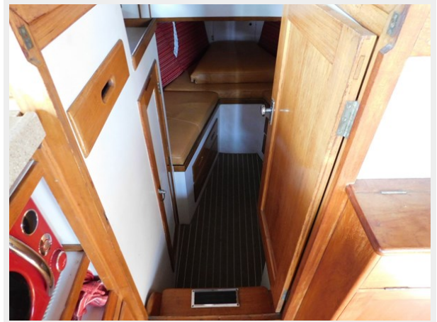
Grand Banks 32 Forward Cabin