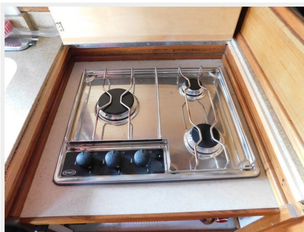
Grand Banks 32 Cocktop