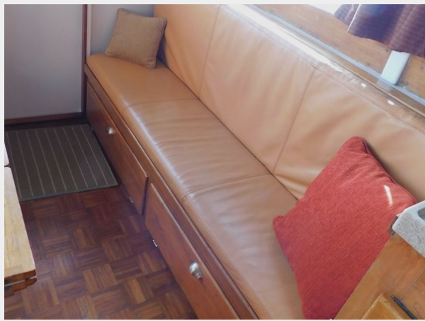
Grand Banks 32 Salon