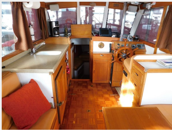
Grand Banks 32 - Looking Forward