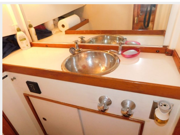
Grand Banks - Head