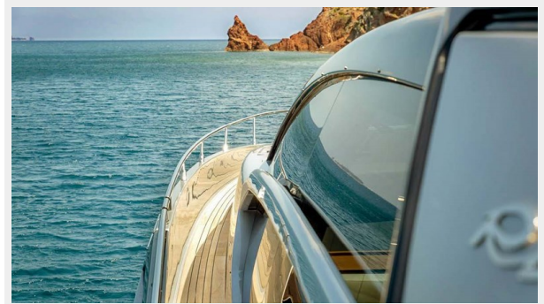
SOUL Brochure 2024.pptx (2)_Page_05_Image_0001