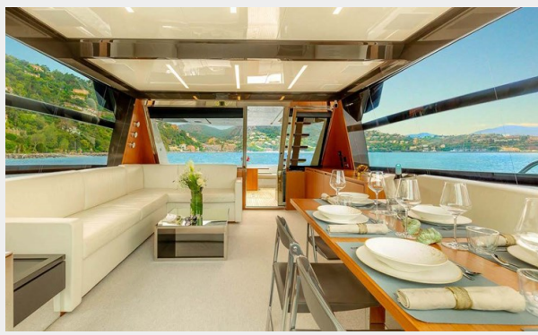
SOUL Brochure 2024.pptx (2)_Page_12_Image_0001