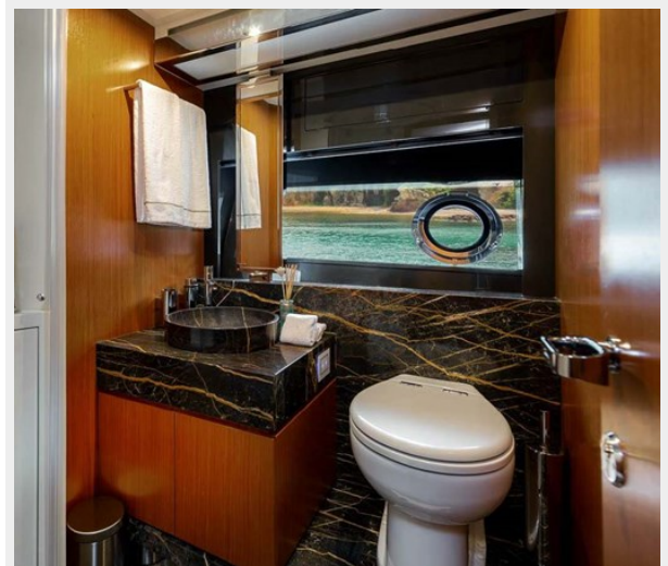
SOUL Brochure 2024.pptx (2)_Page_17_Image_0001