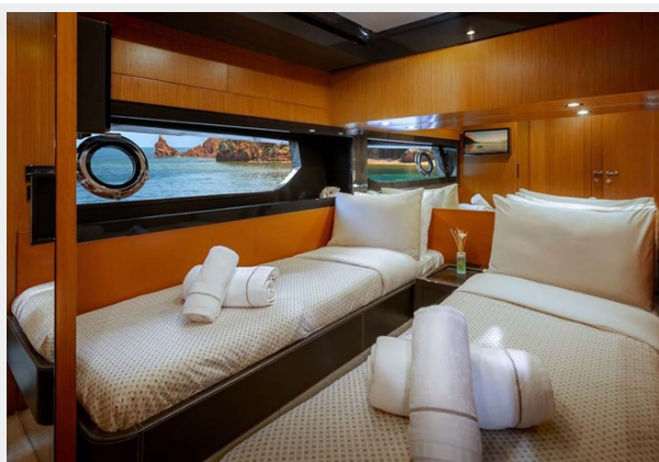
SOUL Brochure 2024.pptx (2)_Page_17_Image_0002