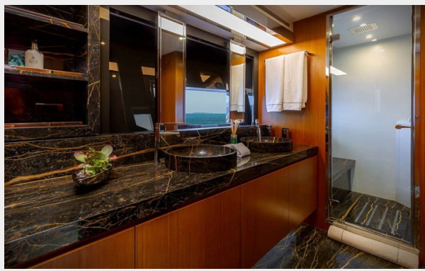
SOUL Brochure 2024.pptx (2)_Page_16_Image_0002