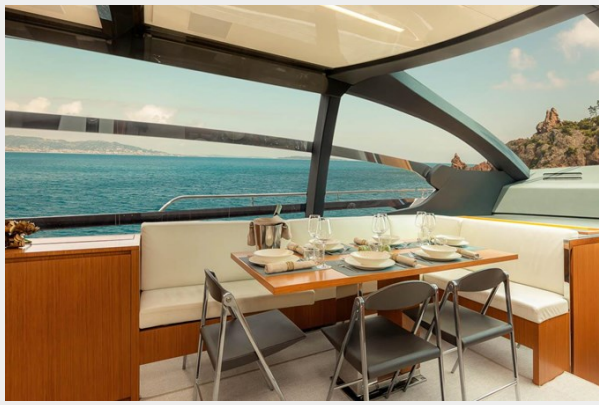
SOUL Brochure 2024.pptx (2)_Page_13_Image_0002