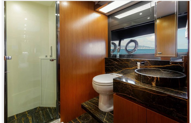
SOUL Brochure 2024.pptx (2)_Page_14_Image_0002