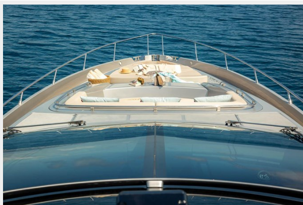
SOUL Brochure 2024.pptx (2)_Page_10_Image_0001