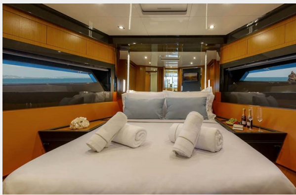
SOUL Brochure 2024.pptx (2)_Page_14_Image_0001