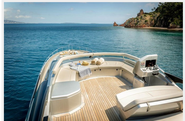
SOUL Brochure 2024.pptx (2)_Page_10_Image_0004