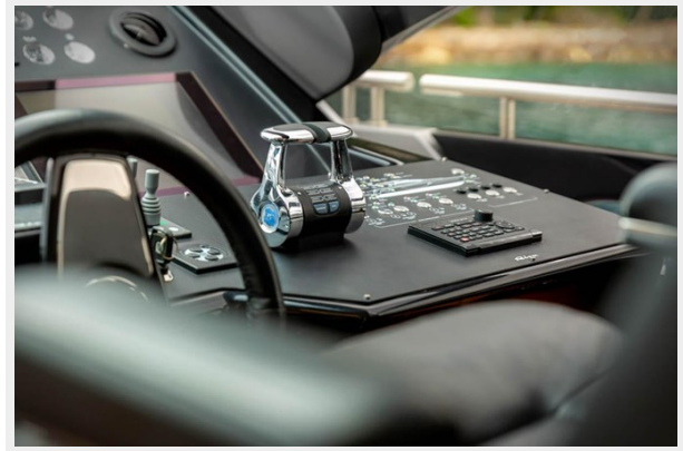
SOUL Brochure 2024.pptx (2)_Page_13_Image_0004