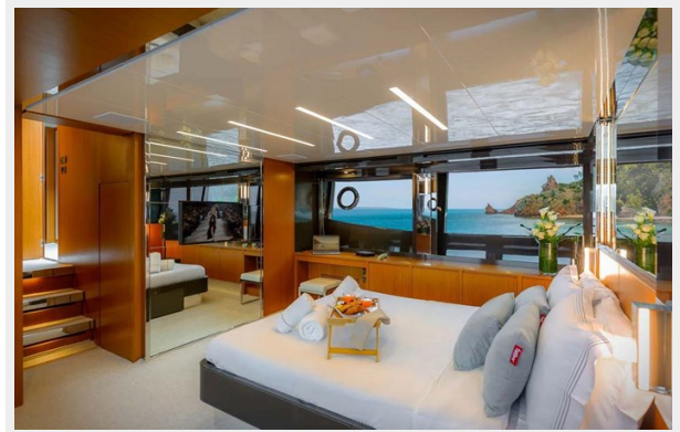
SOUL Brochure 2024.pptx (2)_Page_16_Image_0003