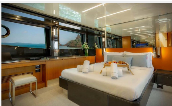
SOUL Brochure 2024.pptx (2)_Page_15_Image_0001