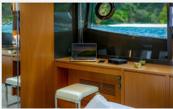
SOUL Brochure 2024.pptx (2)_Page_16_Image_0004