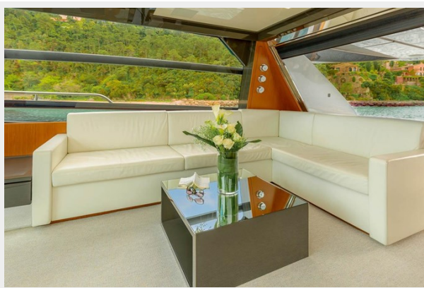
SOUL Brochure 2024.pptx (2)_Page_13_Image_0001