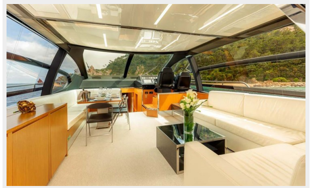
SOUL Brochure 2024.pptx (2)_Page_11_Image_0001