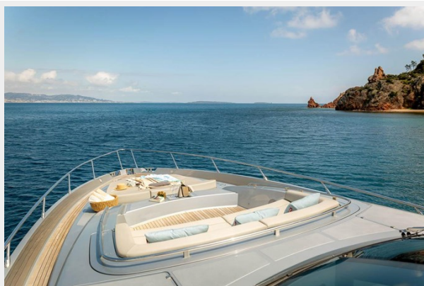
SOUL Brochure 2024.pptx (2)_Page_10_Image_0003