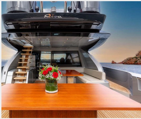
SOUL Brochure 2024.pptx (2)_Page_02_Image_0001