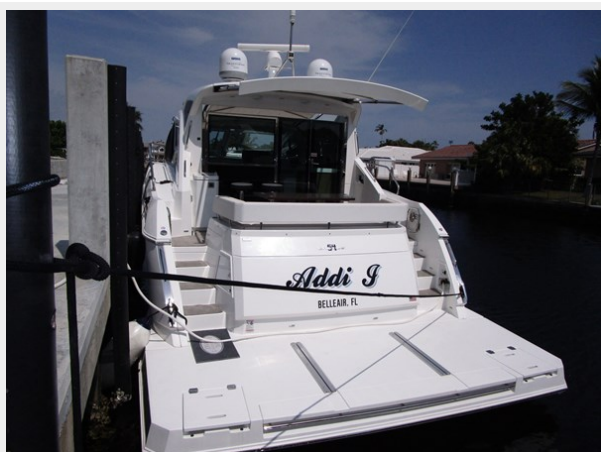
Wide Hydraulic Platform