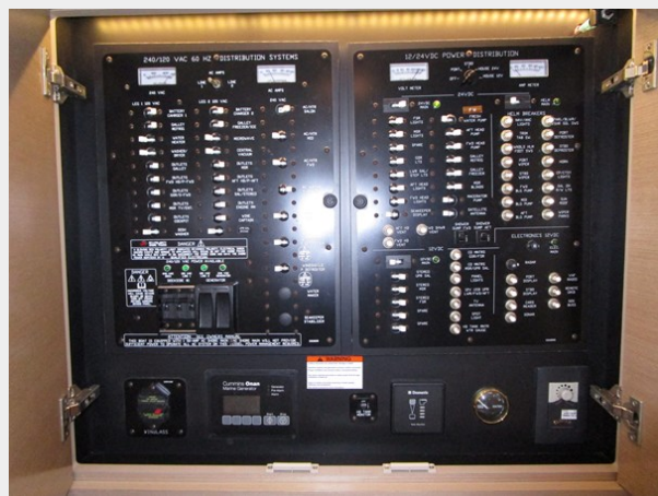
Bunk Room Electrical Panel