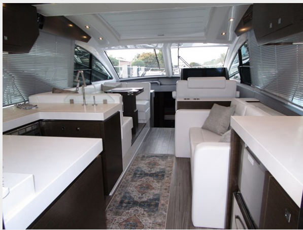
Salon/Galley Looking Forward