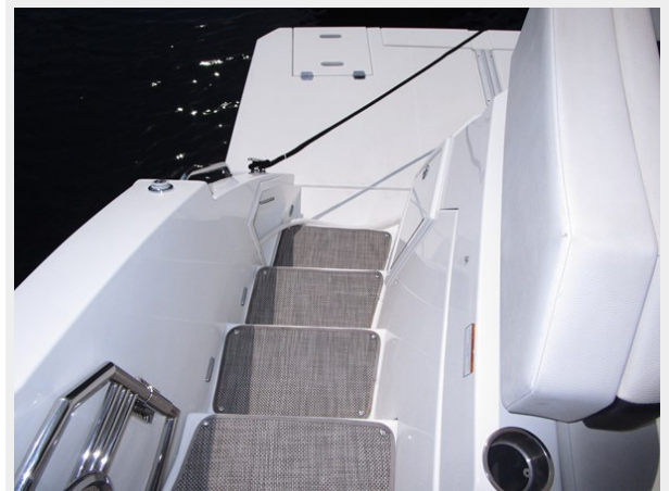
Steps to Hydraulic Platform