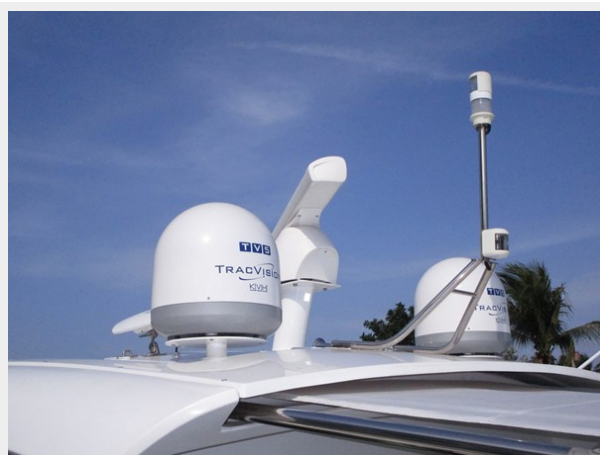
Hard Top Equipment