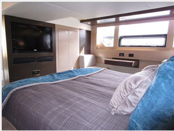
Master Cabin Looking to Starboard