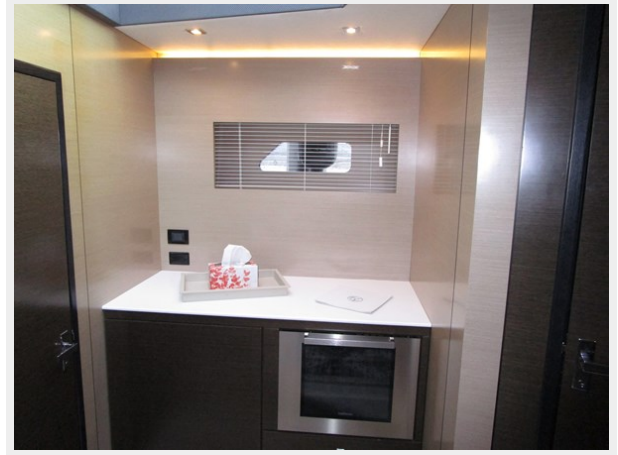
Wine Cooler in Atrium