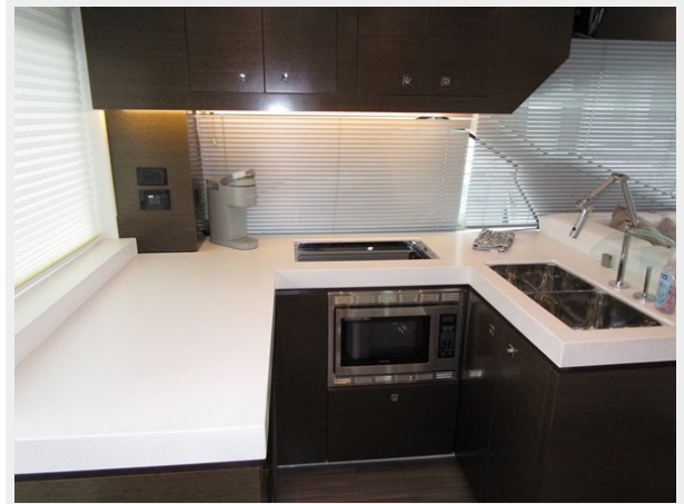
Galley to Port