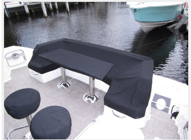
Covers for All