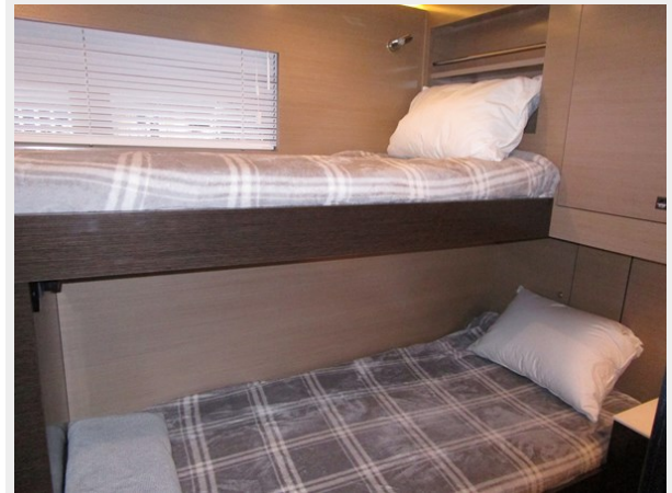
Stbd. Side Bunk Room