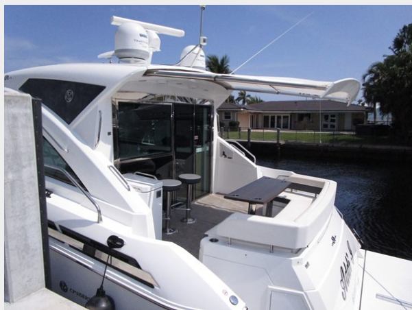
Aft Deck Profile