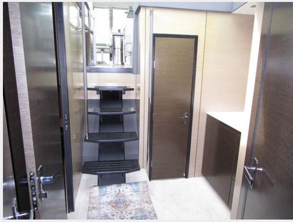
Steps to Below