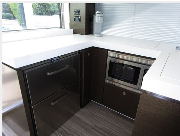
Galley Looking Aft