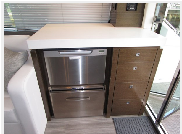
Galley to Stbd.