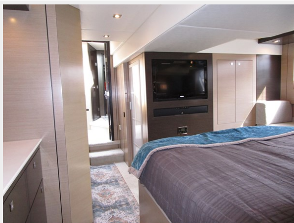
Master Cabin Entry