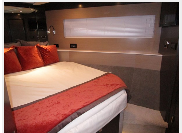
VIP to Stbd.