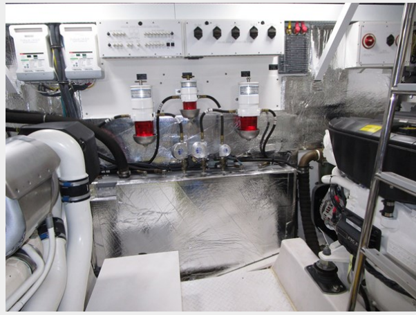
Engine Room Looking Forward