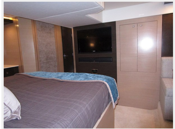
Master Cabin Looking Forward