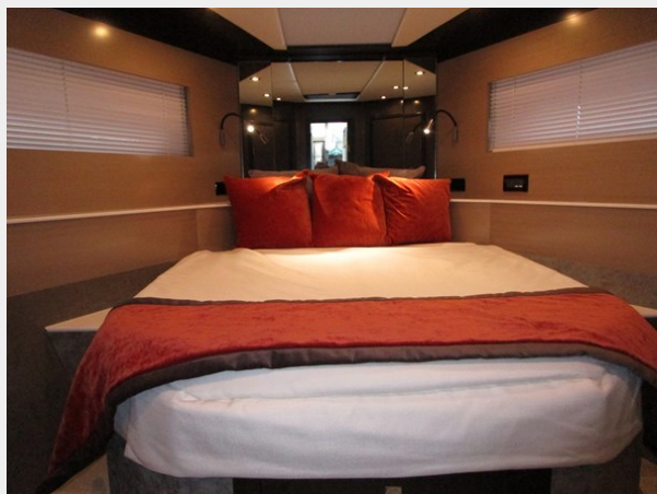
VIP Looking Forward