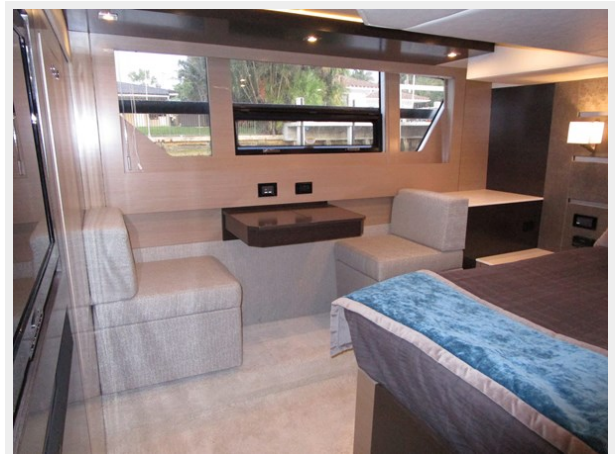
Stbd. Side Seating