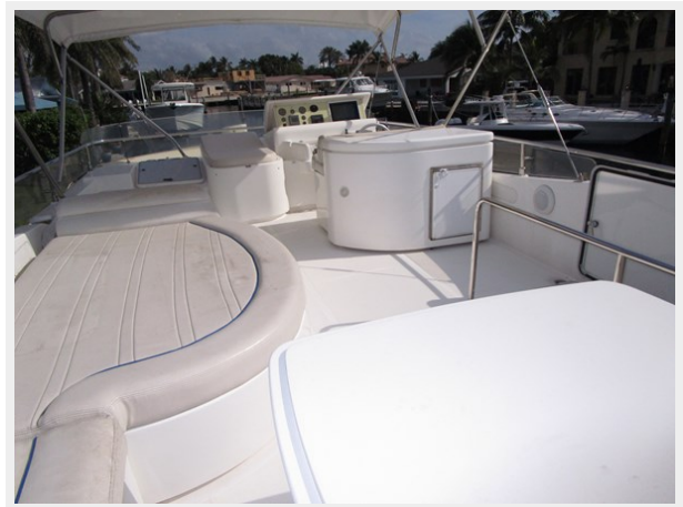
Flybridge Looking Fwd.