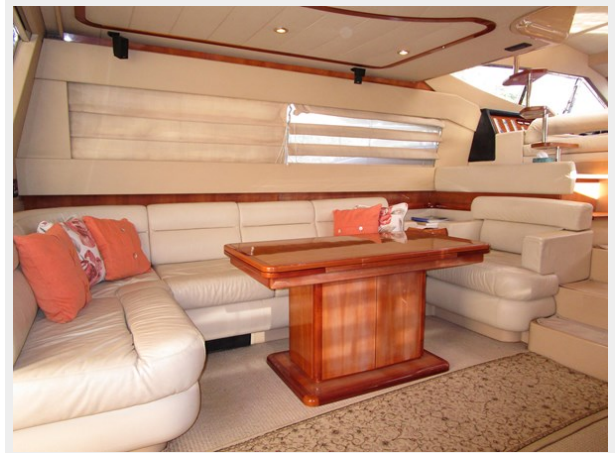
Salon Looking to Port