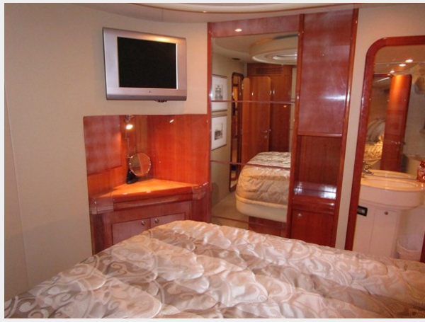
Master Looking Inboard