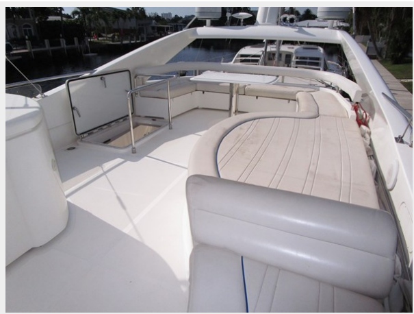
Flybridge Looking Aft