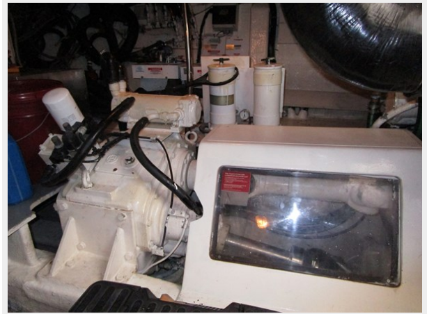
Reverse Gear-V Drive