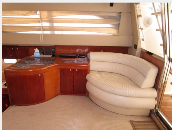
Salon Looking to Stbd.