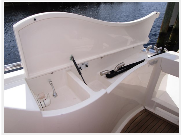
Sink and Cleats