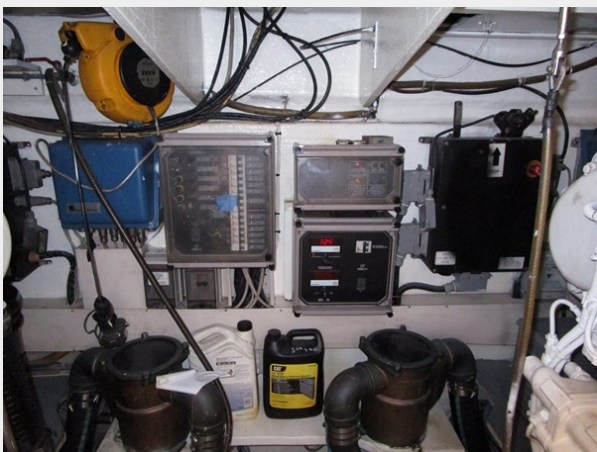
Engine Room Aft