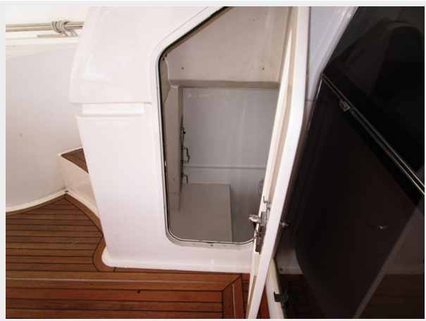
Crew Cabin Entry