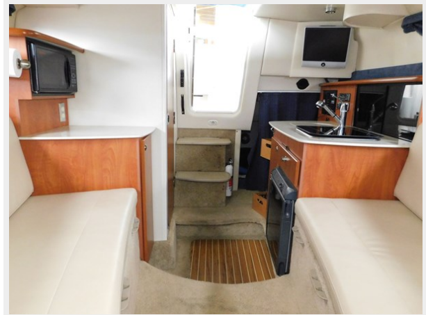
Bayliner 265 - Looking Aft