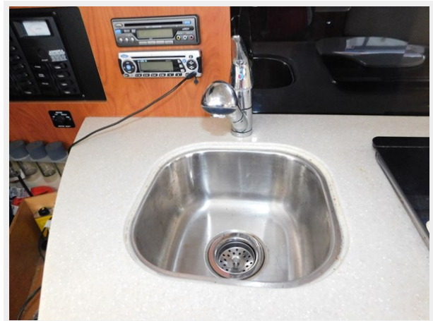
Bayliner 265 - Galley Sink