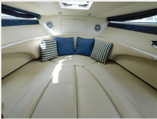
Bayliner 265 - Forward Cabin