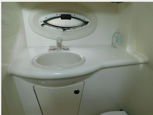
Bayliner 265 - Head