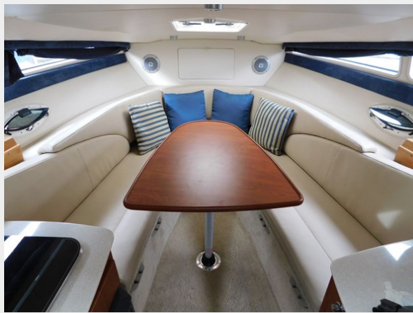
Bayliner 265 - Looking Forward