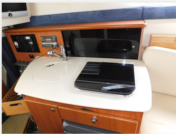
Bayliner 265 - Galley