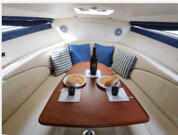
Bayliner 265 - Salon