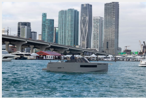
IMG_4045 (1) (Medium)