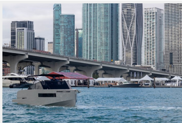
IMG_4047 (1) (Medium)