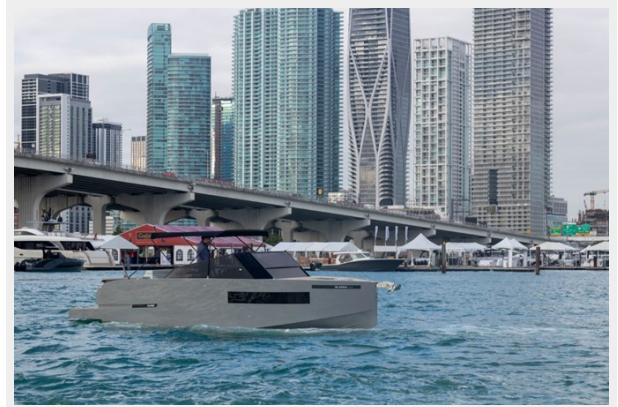
IMG_4046 (1) (Medium)