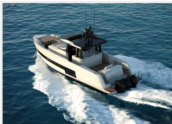
RA560 SY 400FB C0032