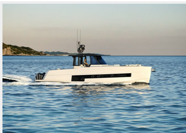
RA560 SY 400FB C0013