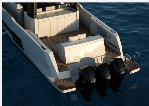
RA560 SY 400FB C0066