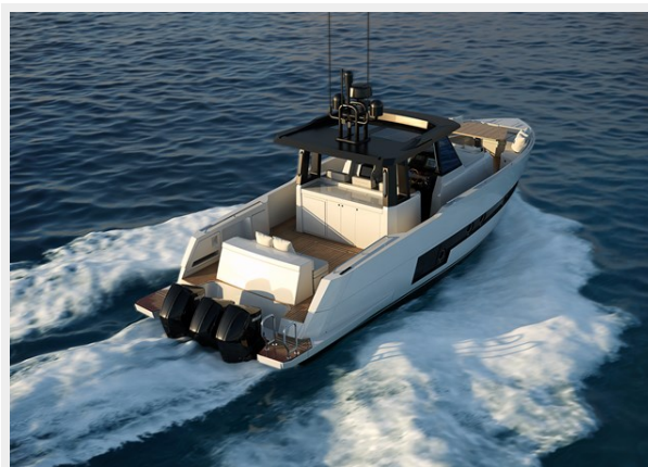
RA560 SY 400FB C0018