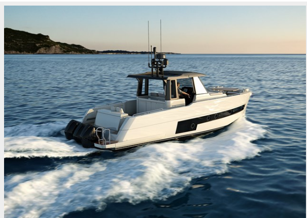
RA560 SY 400FB C0016