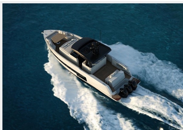
RA560 SY 400FB C0031