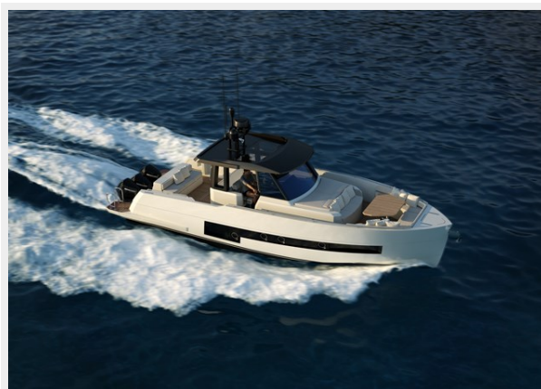
RA560 SY 400FB C0012