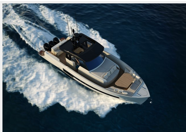
RA560 SY 400FB C0001