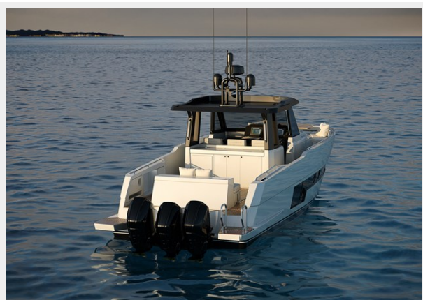
RA560 SY 400FB C0020