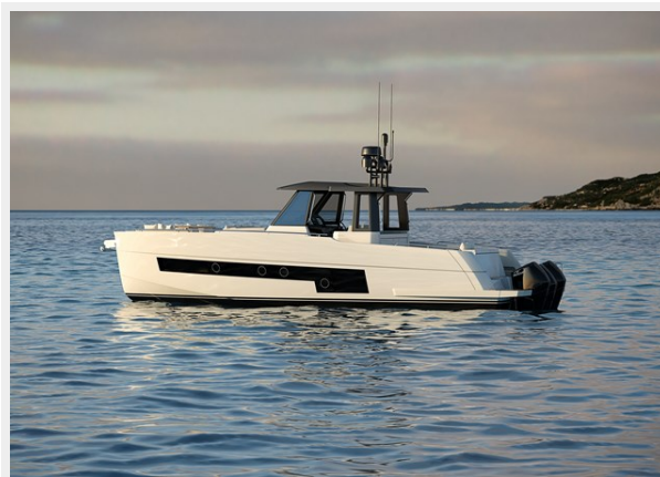
RA560 SY 400FB C0039