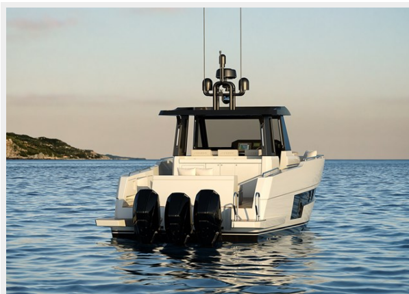
RA560 SY 400FB C0022