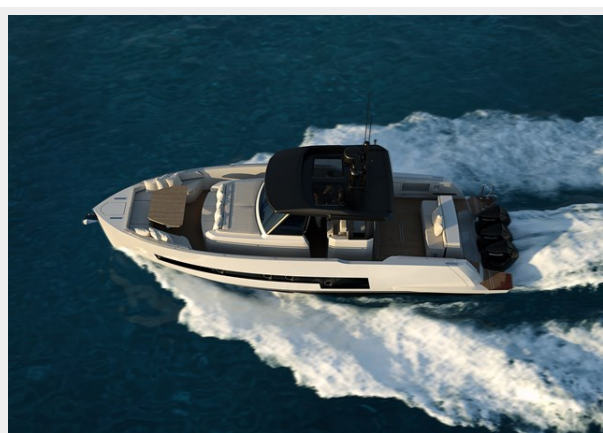
RA560 SY 400FB C0037