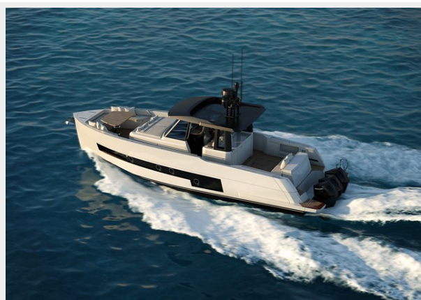
RA560 SY 400FB C0036