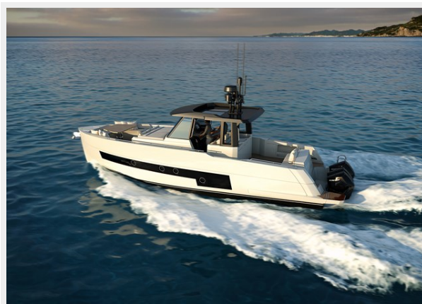
RA560 SY 400FB C0037