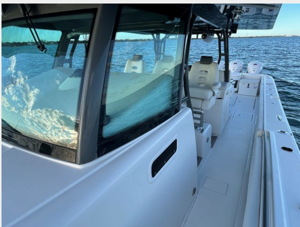
14_2019 53 HCB Suenos FIVE-O