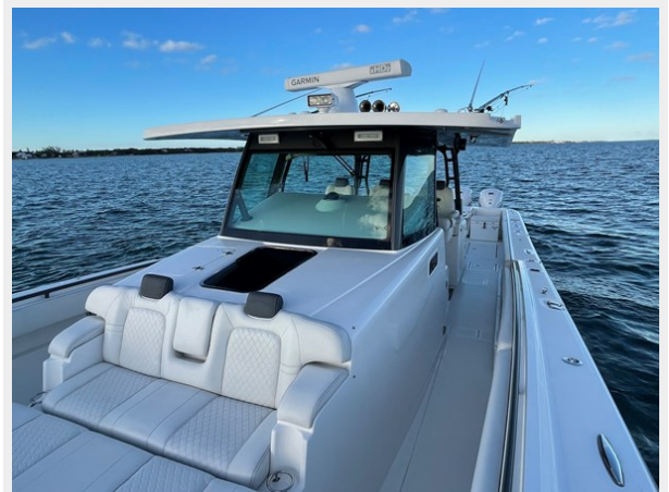
15_2019 53 HCB Suenos FIVE-O