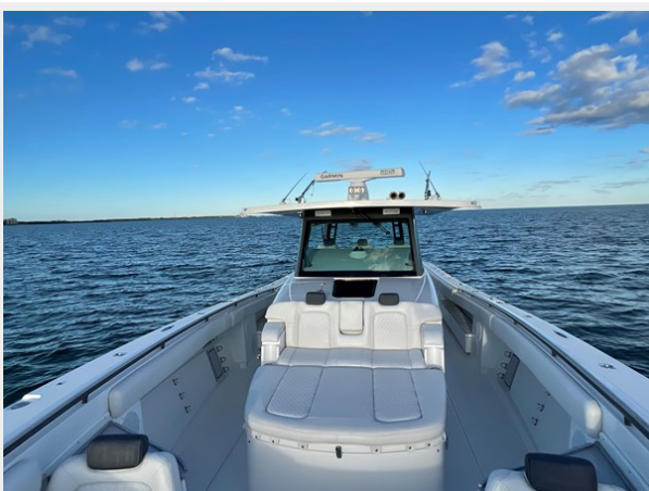
10_2019 53 HCB Suenos FIVE-O