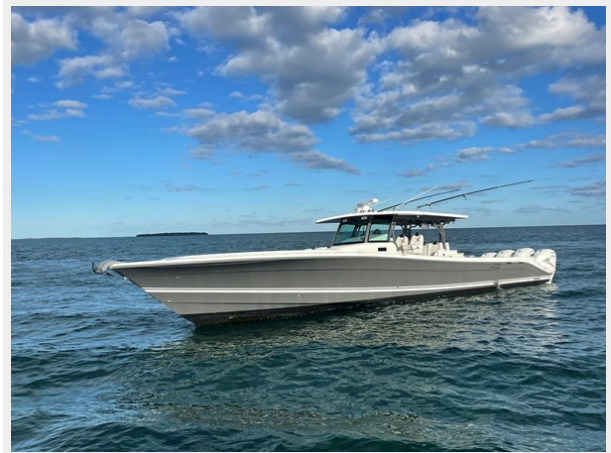
3_2019 53 HCB Suenos FIVE-O