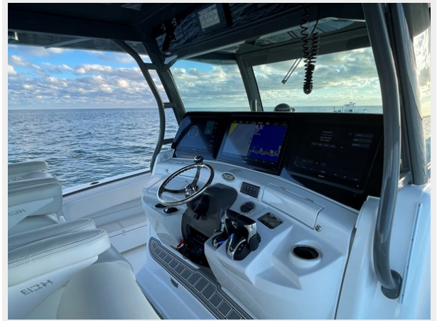
13_2019 53 HCB Suenos FIVE-O