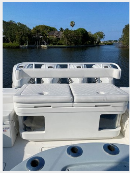
18_2019 53 HCB Suenos FIVE-O