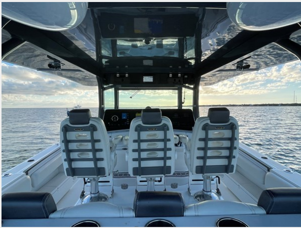
6_2019 53 HCB Suenos FIVE-O