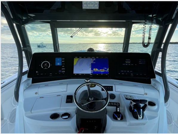
12_2019 53 HCB Suenos FIVE-O