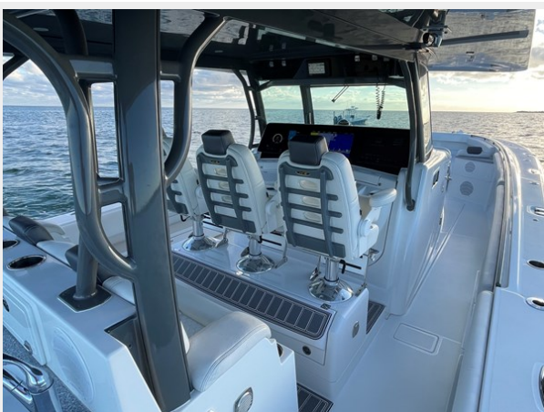
16_2019 53 HCB Suenos FIVE-O