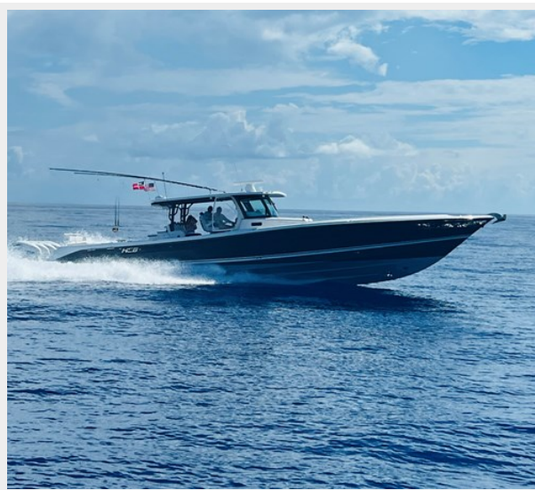
4_2019 53 HCB Suenos FIVE-O