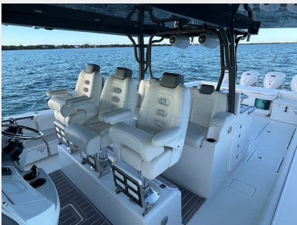
8_2019 53 HCB Suenos FIVE-O