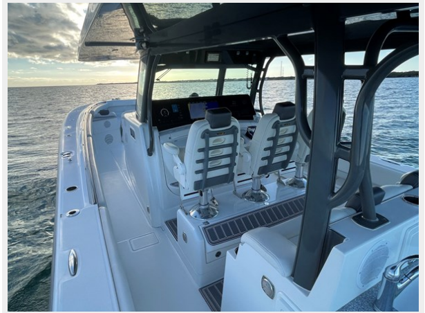
7_2019 53 HCB Suenos FIVE-O