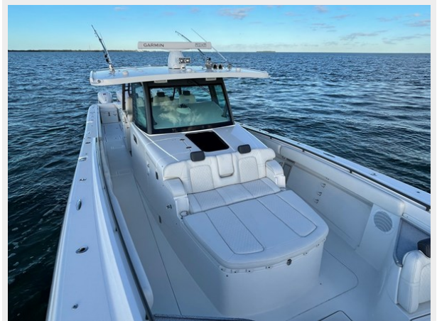
9_2019 53 HCB Suenos FIVE-O