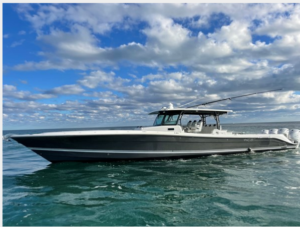
2_2019 53 HCB Suenos FIVE-O