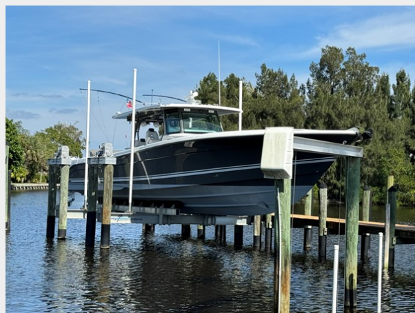
20_2019 53 HCB Suenos FIVE-O