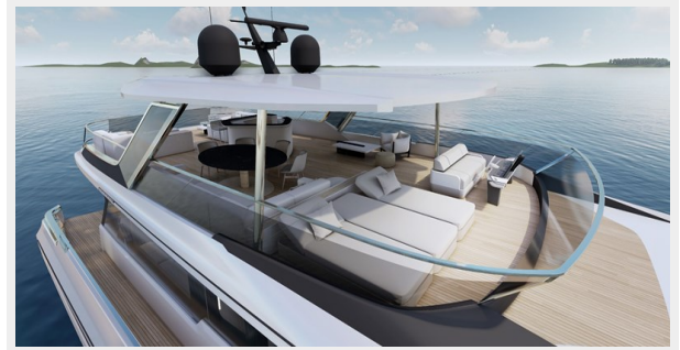
Xcel 70 Flybridge 1